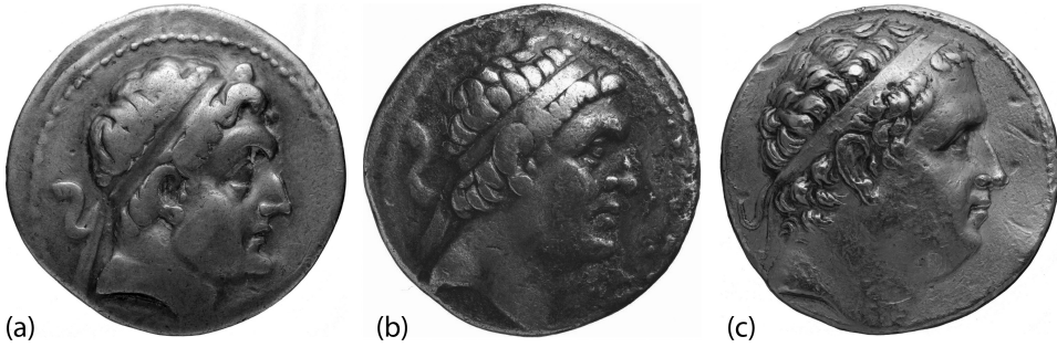
Figure 23.2 Euthydemos I through his various portrayals (BNF 1974.393; 1966 Don Delepierre; 1966.163).

characterized by the evolution of this type during his reign. What is more, he is the first Graeco-Bactrian king to be depicted first young (or middle-aged) and then old on his coins. However, our study revealed that the introduction of portraits depicting an older king did not mean the disappearance of portraits depicting a younger one: on the contrary, their production carries on (as an idealized portrayal of Euthydemos I?) along with a new monogram (𐎲), which suggests that these coins could be related to the rising to an elevated royal status of his son Demetrius I at the very end of the third century BCE (Figure 23.2).