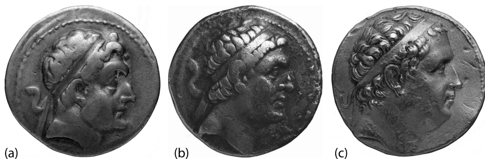
Figure 23.2 Euthydemos I through his various portrayals (BNF 1974.393; 1966 Don Delepierre; 1966.163).

characterized by the evolution of this type during his reign. What is more, he is the first Graeco-Bactrian king to be depicted first young (or middle-aged) and then old on his coins. However, our study revealed that the introduction of portraits depicting an older king did not mean the disappearance of portraits depicting a younger one: on the contrary, their production carries on (as an idealized portrayal of Euthydemos I?) along with a new monogram (𐎲), which suggests that these coins could be related to the rising to an elevated royal status of his son Demetrius I at the very end of the third century BCE (Figure 23.2).