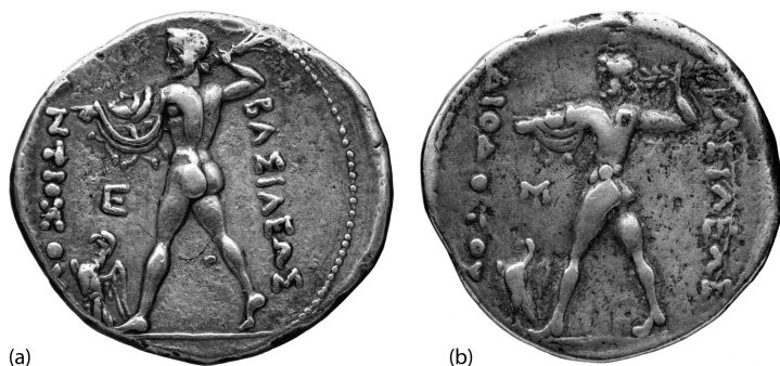
Figure 23.1 Comparison between types engraved before/after the legend (BNF 1972.392; K 2801 (BNF 1972.392; K 2801 ).

illustrated in this paper, but also that the change in deity (from the Seleukid seated Apollo) is the main feature to be acknowledged in this instance. When examining the so-called ‘pedigree’ coins struck by Agathocles and Antimachos I (Bopearachchi 1991, series 12–18; 9–10), Jakobsson considers the following points: the portrait of Antiochos Nikator does not look like Diodotos Soter, meaning it is a different person; Antiochos II’s epithet is Theos and not Nikator; Agathocles would rather have honoured Seleukos I or Antiochos I, as they were more involved with Bactria. O. Bopearachchi (1999, 79–80, note 122) has already given sufficient evidence that both portraits on the ‘pedigree’ coins were actually very close in style and thus engraved by the same person. Regarding epithets, there is reason to think that they were created ex nihilo by Agathocles, and that precise numismatic accuracy was likely considered secondary. Finally, the goal of these commemorative issues, unlike the people studying them, was not to give a truthful historical outline, but rather to honour others in order to honour oneself: featuring Antiochos II makes sense if one considers that independence was achieved under his rule. We thus consider Jakobsson’s hypothesis with great caution, as it lacks solid typological and historical grounds in its demonstration.