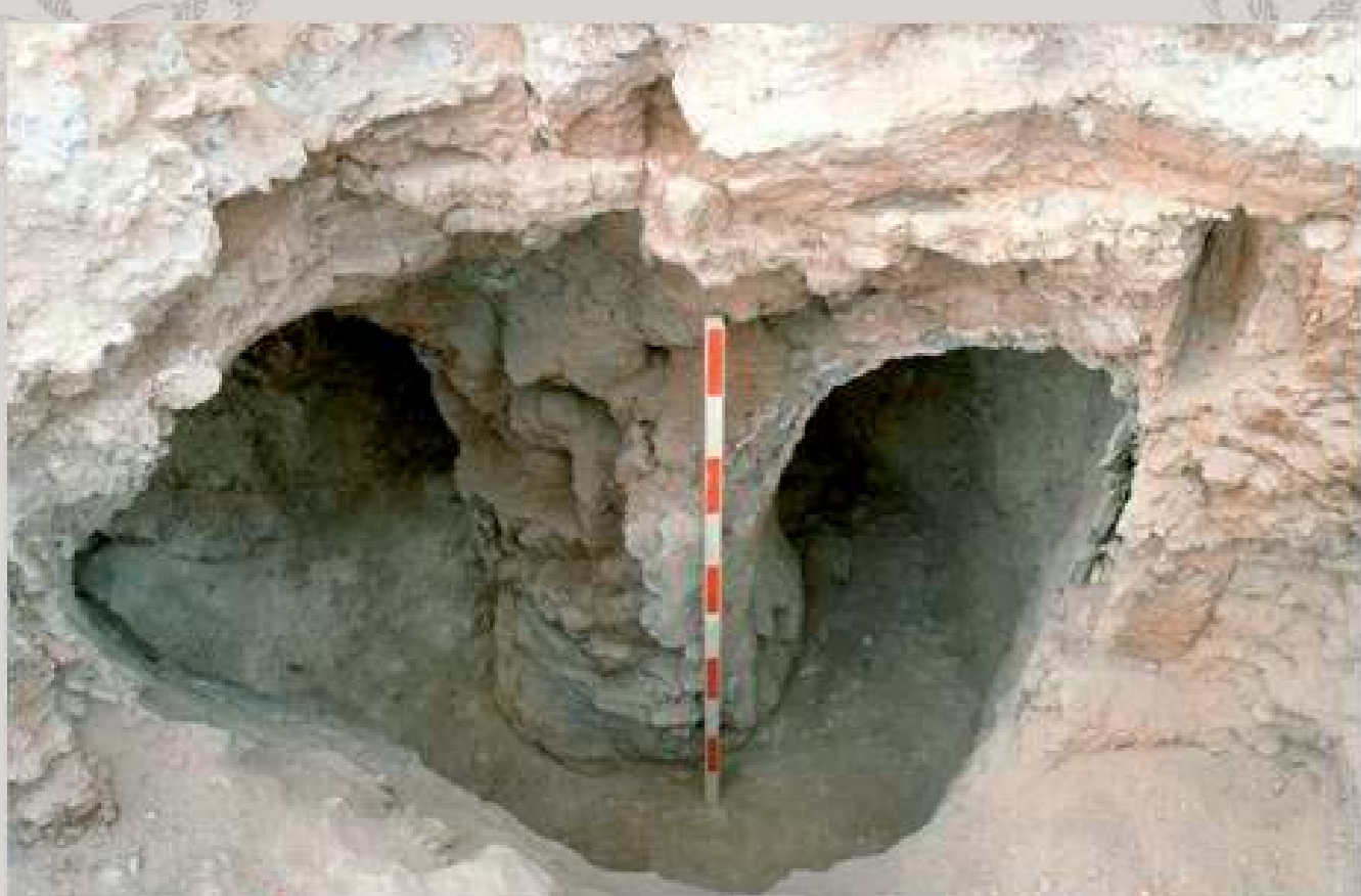
Lal Shah: double-chamber potter's kiln from period Nausharo IC (2700-2600 BC).