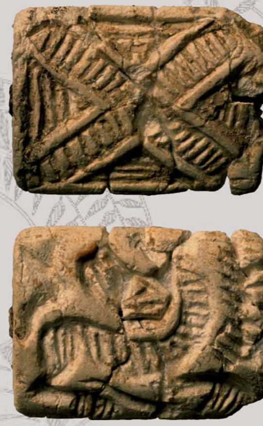
Funerary pottery from Dauda Damb, seal and metal weapon from Sibri (2100-1900 BC).