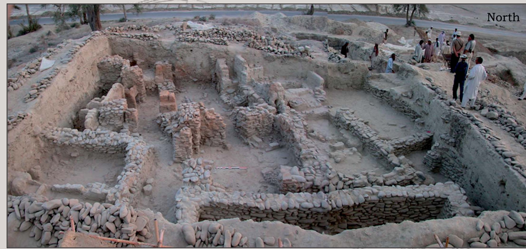
Period II architectural levels in Trench II (1 st half of the 4 th millennium BC).

The site of Shahi-Tump (10km south from Miri Qalat) is located on the left bank of the Kech River. The objective of the field-campaigns was to broaden our knowledge of the Chalcolithic occupation (5 th -4 th millennium BC) in Makran. Circular hut basements dated to period I (5 th millennium BC) were excavated in Trench I, while several Period II (1 st half of the 4 th millennium BC) architectural levels with quadrangular rooms built in stone and mudbricks were unearthed in Trench II on the top of the site. The period II occupation is also characterized by the discovery of burials which form the "oldest cemetery of Shahi-Tump". A later cemetery, dated to period IIIa (2 nd half of the 4 th millennium/beginning of the 3 rd millennium BC), has also provided the remains of 120 individuals buried with rich funerary deposits which included numerous painted pottery and highly elaborated craft products: metal objects (seals, tools, mirrors...), beads, stone vessels, etc.