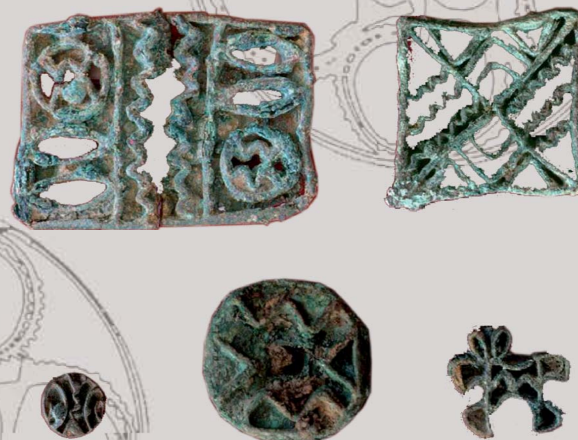
Metal seals and necklace (beads in fired and unfired steatite, cornelian and lapis-lazuli) discovered in period IIIa graves (2 nd half of the 4 th millennium/beginning of the 3 rd millennium BC).