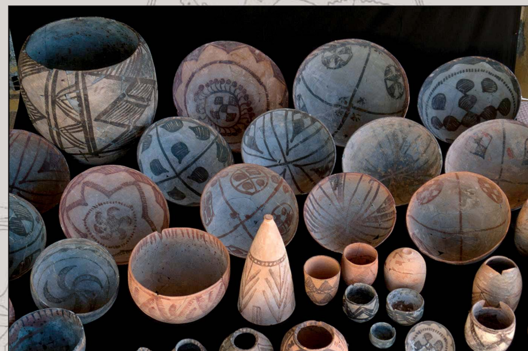
Funerary pottery from period IIIa (2 nd half of the 4 th millennium/beginning of the 3 rd millennium BC).