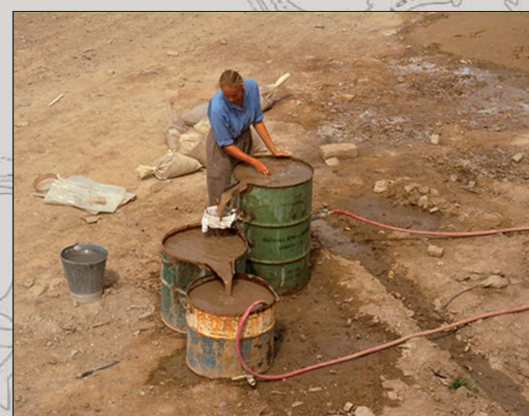
Protohistoric grape seed and flotation treatment processed by M. Tengberg to collect archaeobotanic remains.