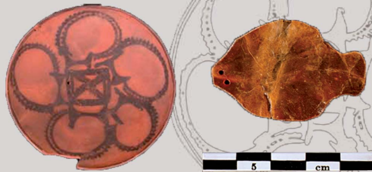
Period II pottery and fish-pendant in mother-of pearl (1 st half of the 4 th millennium BC).