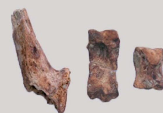
Studying mammal and fish bone remains.