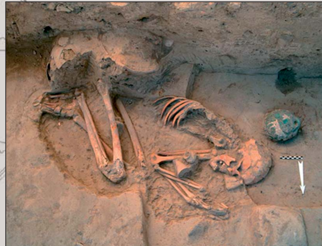
A period IIIa grave with the 'leopard weight' (2 nd half of the 4 th millennium / beginning of the 3 rd mil. BC).