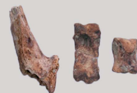
Studying mammal and fish bone remains.