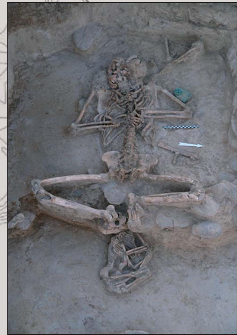
Period II grave (1 st half of the 4 th millennium BC).