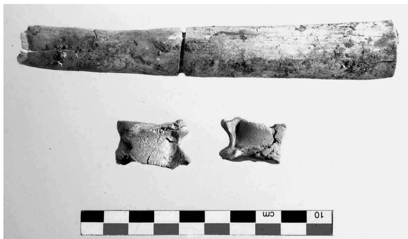
Fig. 9 Funerary material from grave 2520 (Mission archéologique de Tell Shiukh Fawqâni)