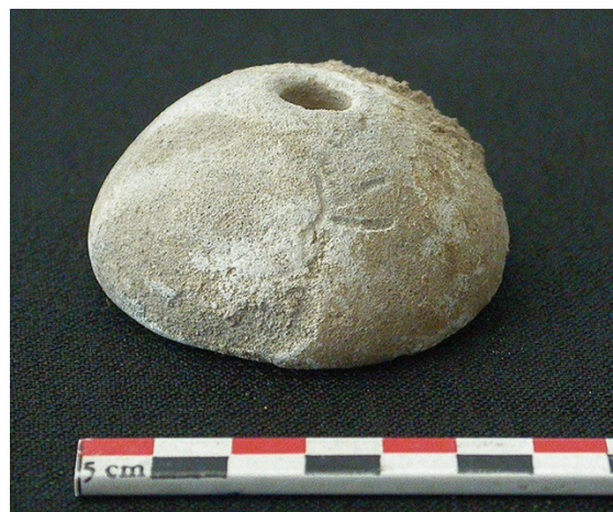
Fig. 4 Spindle whorl 2441.3.1.6. It was found with 9 others in a cinerary urn. It is the only one that displays such a mark

tion is between 0.3 and 0.6cm. 10 Some were made of soft stone (Fig. 1), others in black hard stone, others were in vitreous material. Some were decorated with incised parallel lines (Fig. 2). One spindle whorl (2478.1.6), heavily damaged by fire on the pyre, presents a unique and atypical elongated shape (Fig. 3).