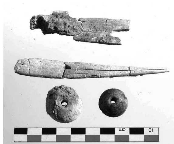
Fig. 8 Funerary material from grave 2511

In grave 2511, we discovered, mixed with the cremated bones, two spindle whorls and two bone objects. We may assume they may have been used as weaving tools: a shuttle (2511.1.1) and (2511.1.5) a beater used to push the weft yarn into place (Fig. 7 b–c, Fig. 8). Woolley discovered