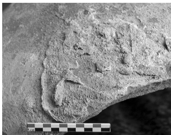
Fig. 10 Concretions on fabric which wrapped jar 2528.2 (Mission archéologique de Tell Shiukh Fawqâni)