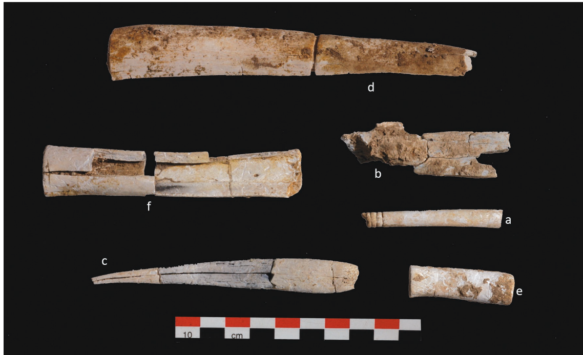
Fig. 7 Bone objects discovered in several graves (Mission archéologique de Tell Shiukh Fawqâni)

horizontal grooves for attaching thread. 16 It was found in the same grave as three spindle whorls and a very intriguing iron object. It is badly corroded but its general shape is reminiscent of distaffs. 17 Unfortunately the complete analysis of the bones by Isabelle Le Goff is still in progress, so we have no information on the sexual identity of the deceased. Graves from Yunus 18 or Hama 19 yielded comparable bone or ivory shafts which can be interpreted as spindles or distaffs.