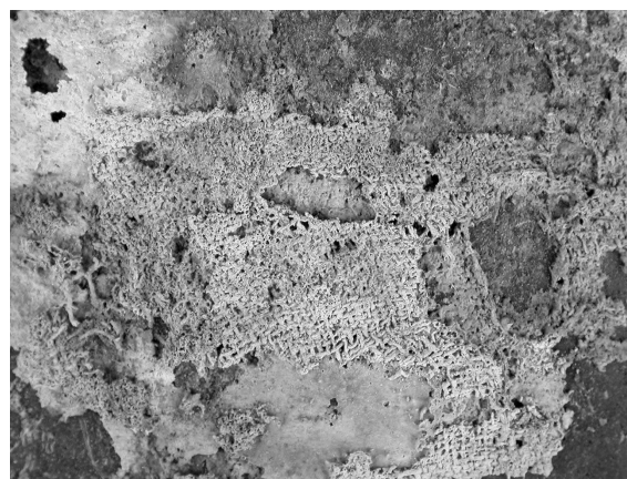
Fig. 11 Fabric on jar 4026.2 (Mission archéologique de Tell Shiukh Fawqâni)

and the Iron Age, 34 but one cannot exclude the possibility that textile production was so important that it gave women a high social status. This hint could show that even if the working environment of female workers was mainly at home, they also had activities outside the house. This hypothesis remains highly speculative but not absurd. Another explanation relies on discoveries made in Neolithic contexts in the Danube Basin. Bovine astragals were used there as loom-weights; 35 sheep or goat astragals are smaller and lighter, but they may have been used as spools.