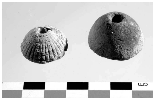
Fig. 2 Two spindle whorls from grave 2635.5

the side of the urn. None of these objects show signs of fire meaning they were not placed on the pyre with the dead.