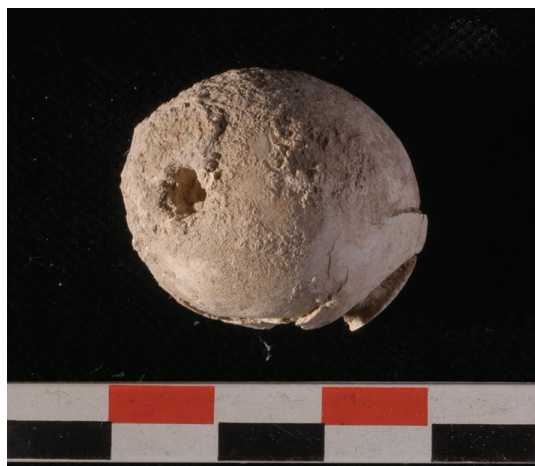
Fig. 3 Spindle whorl 2478.1.6. Its elongated shape is unusual in the necropolis (Mission archéologique de Tell Shiukh Fawqâni)