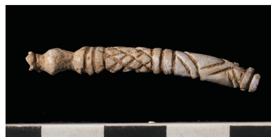
Fig. 6 Fragmentary spindle 2435.3.1 (l. 3.2cm, d. max. 0.35cm)

At Tell Shiukh Fawqâni, no spindle whorl has been found on a spindle. We cannot exclude the possibility they were made in wood and were thus completely destroyed on the pyre. Two objects, however, show clear similarities with examples studied by Caroline Sauvage. 15 Heating probably deformed both. Unfortunately, 2435.3.1 (Fig. 6) was found between the graves. It is broken but belongs to the category of pomegranate shafts interpreted as spindles. The other one (2635.4.1.7) (Fig. 7a) shows