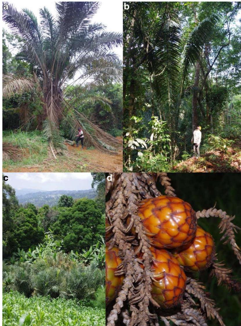
Fig. 1. A sample of Raphia species.

A: R. zamiana from northern Gabon. B: R. regalis from Gabon. C: R. vinifera from northwestern Cameroon, growing in maize and banana fields; D: Close up of a Raphia gabonica fruit.