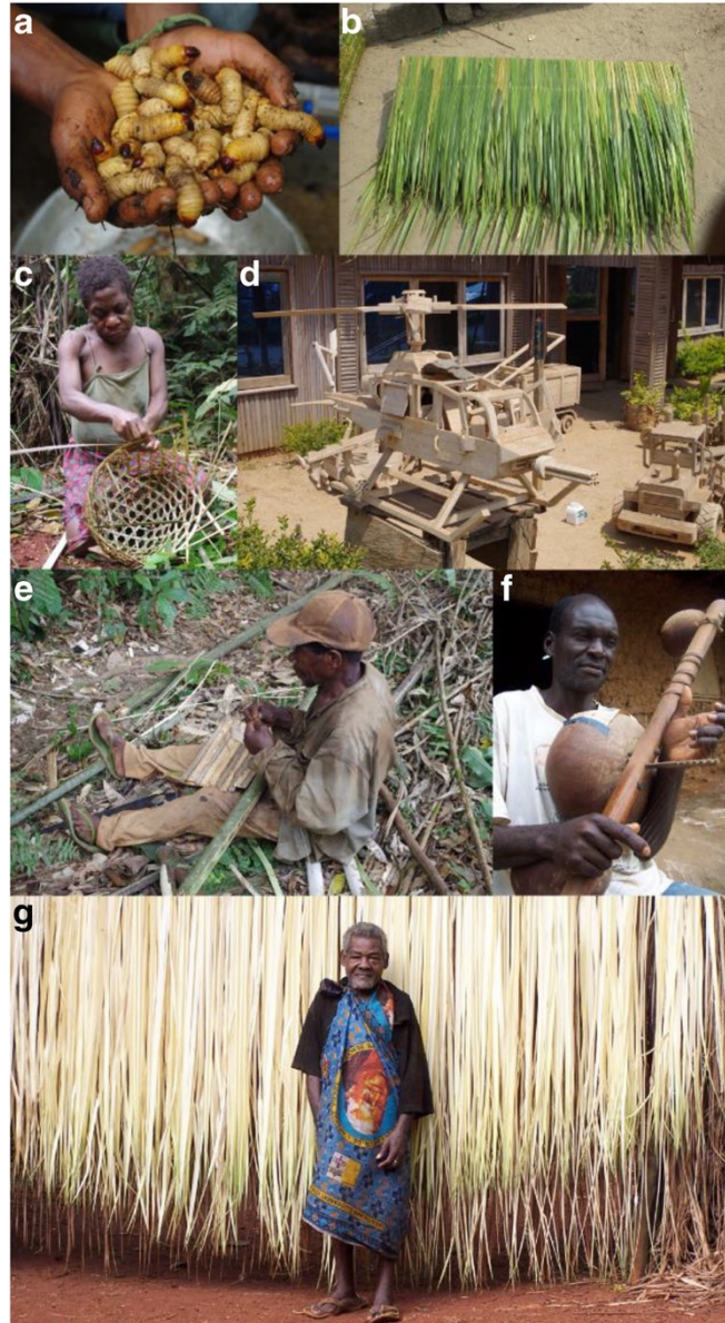
Fig. 4. The multitude of uses of Raphia species - 2.

A. Raphia hookeri wine tapping, drone view, Lomié, Cameroon. B. Raphia vinifera wine shared between notables during a ceremony at Oku, Cameoon. C. Recently dyed drying Raphia fibers near Douala, Cameroon. D. Raphia fiber uses for furniture construction near Douala, Cameroon.