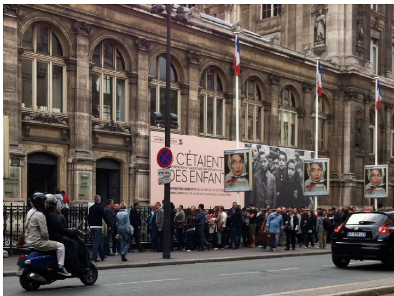
Image 2. Entrance and exhibition poster, Paris Town Hall, October 2012.