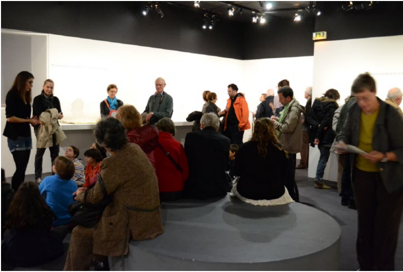
Image 4. A class visiting the exhibition beneath the gaze of numerous visitors, witnessing memory.