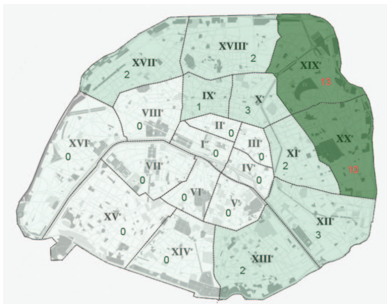
Map. Distribution by district of the 40 school classes that attended the exhibition.