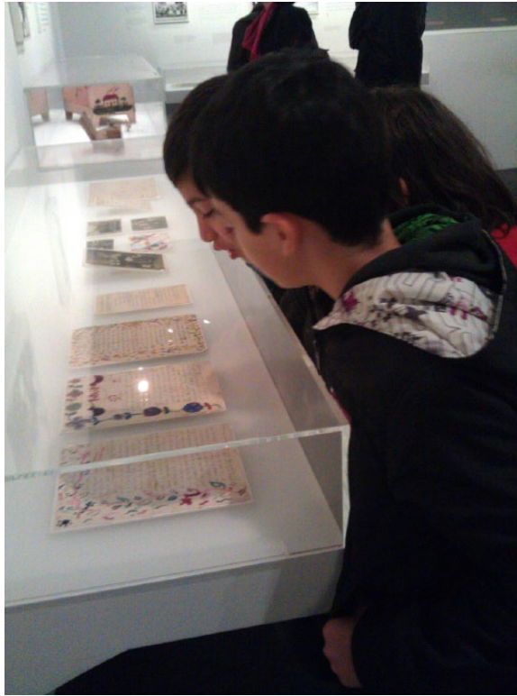
Image 3. Visit of a class from the 18th district, 16 October 2012. 'There aren't many spelling mistakes, you see? They wrote well'.

issue of values in museums is not new but has not given way to studies of their actual appropriations (Huistra and al, 2014; Jonsson, 2012). As was said previously, few of the visitors ultimately make reference to particular artefacts of the exhibition, and the historical narrations in themselves are rarely assimilated. However, the values that this exhibition is intended to convey are indeed – and abundantly – cited: the emotion, the 'importance of memory', the 'never again', the fight against racism and anti-Semitism, tolerance and equality, the defence of the Republic and democracy. In other words, rather than the transmission of historical information and civic values, visiting history enables the witnessing of the very process of transmission, for oneself but most of all for 'others'. The social effect of the exhibition relies first on the fact that the visitors observe each other and, in doing so, mutually reinforce the social value of the lessons that they are intended to draw from this Holocaust history exhibition.