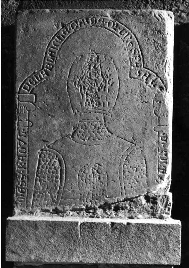
Figure 14.1 Tomb for Raoul de la Blanche Garde, thirteenth century. Cathedral of Saint Sophia, Nicosia, Cyprus.

epigraphy between the various regions of the West and the East. The practice increased at the end of the Latin Kingdom of Jerusalem, with the fall of Saint-Jean-d'Acre in 1291. Tomb slabs with effigies in Cyprus mostly belong to the fourteenth century. Though the slab was the most common medium in Cyprus from the thirteenth, 47 the works that were realised during this century are less frequent and are varied and idiosyncratic in format compared to later examples, for instance the epitaph of a knight in Nicosia (Fig. 14.1). 48 In France, there is a clear distinction between the north (including Burgundy and Normandy where tomb slabs were abundant; the tomb for Calon of Saulx is just one of the examples (Fig.14.2)) and the south. Lisa Barber has noted that