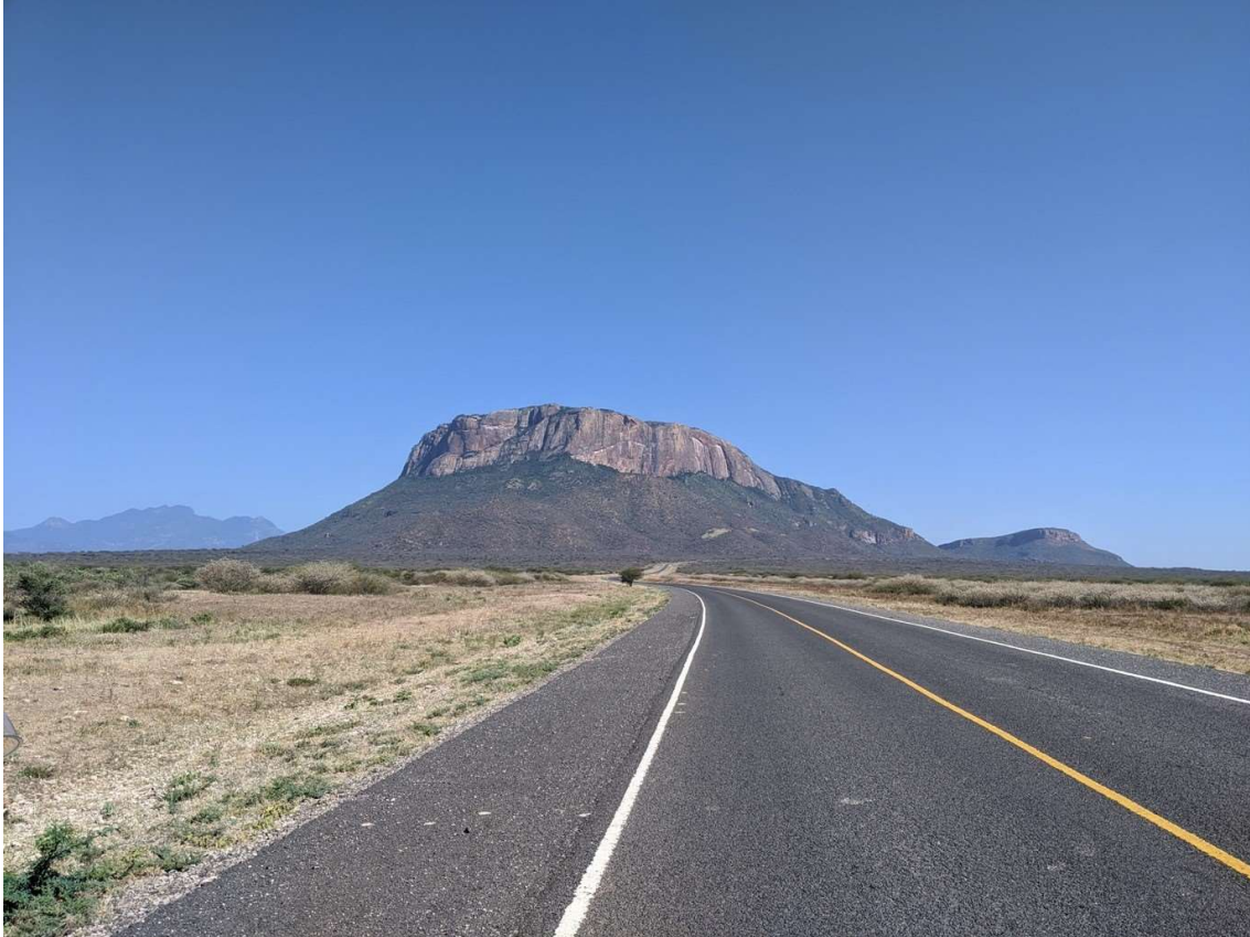
Figure 1. Moyale highway running through Kalama conservancy, view of Mt. Ololokwe

phone call away” 1 : an impressive 530,000 to 680,000 civilian households possess firearms (Wepundi et al. 2012, 47). Cattle raiding has, with help of firearms, transformed since the 1980s from a small-scale cultural practice into commercialised raiding—a means of resource accumulation or a commercial enterprise, escalating physical insecurity (Sharamo 2014; Ltipalei, Kivuva, and Jonyo 2018; Osamba 2000; 2001; African Union and Small Arms Survey 2019; Marmone 2017).