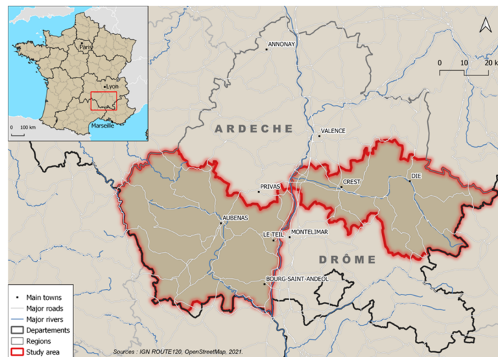
Figure 1. Study areas.