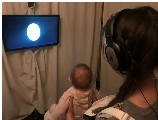
Figure 2: Experimental box and set up