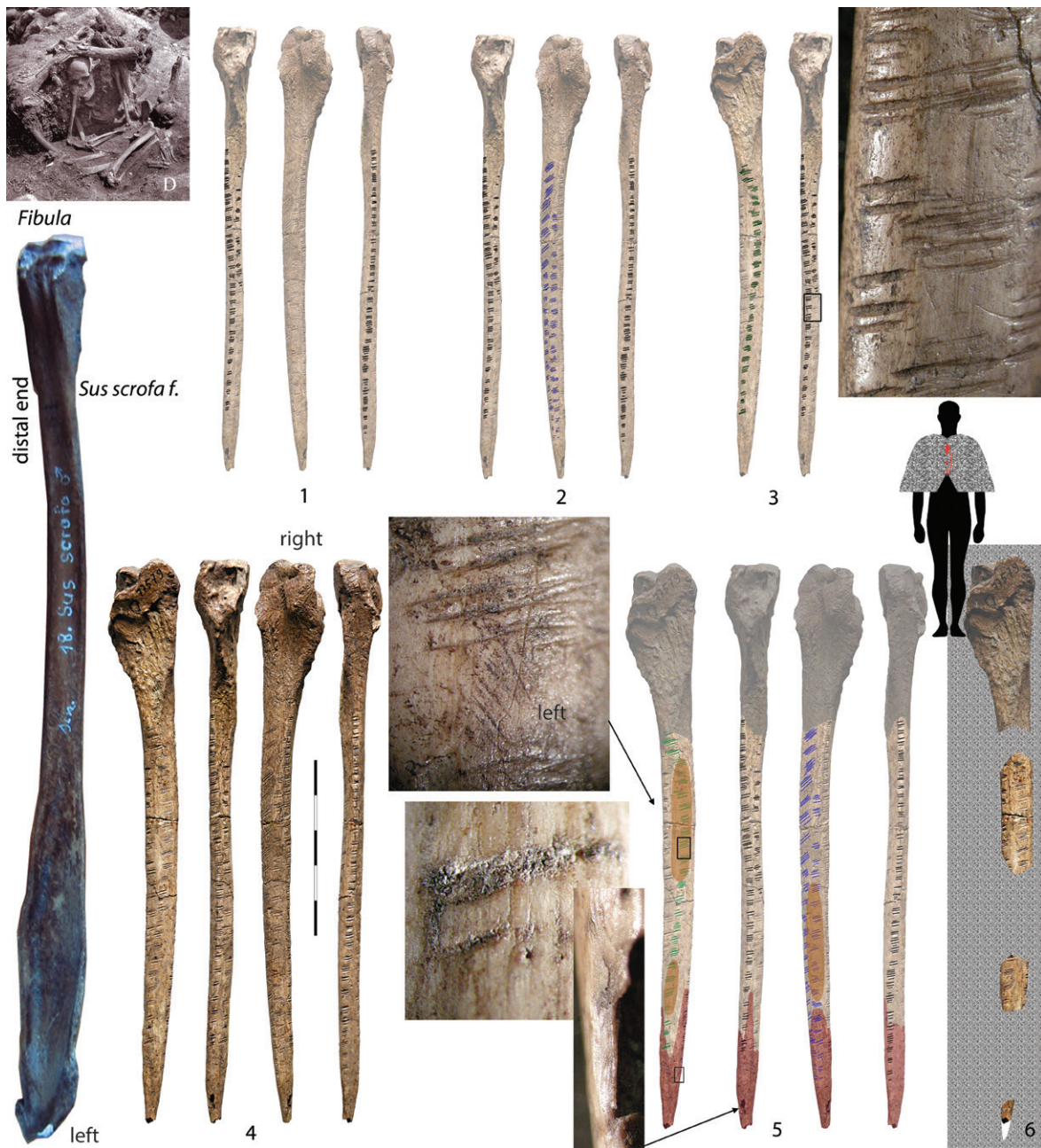
Fig. 93.3. A Mesolithic engraved bone point from grave 'D' at Tévéc with its anatomical provenance (no. 4). The depth, size, and morphology of the visible notches that compose the motif along with their overlap offer a reconstruction of the stages of engraving in the form of a series (nos. 1–3). It was freshly engraved by two axial series made anatomically opposite on the stem, firstly bilateral (no. 1) and secondly facial (no. 2) or bifacial (no. 3). The tip was reshaped on all sides and used again until it was broken, and was reshaped again, making the notches on the tip almost invisible (no. 5: middle picture at the bottom). The basal-end shows no use-wear at all, only two cutmarks (on the lateral anatomical face) probably linked to the initial extraction of the used blank from a tibia (no. 4). The rough end (shaded grey) clearly indicates a demarcation line in relation to the rest of the point and smoothed stem. On the stem, three zones, two of which are opposing, show clear use marks in the form of scratched areas (no. 5, upper picture). Parts of the stem were probably visible when the other remaining parts of the point were covered by a cloth, and thus protected from any further alteration due to use. The point was probably used as a kind of safety pin in conjunction with perishable organic matter that probably encompassed the basal-end of the point (sinew or hide?) that may have extended towards the tip and onto which it was somehow fixed in an efficient manner (no. 6).