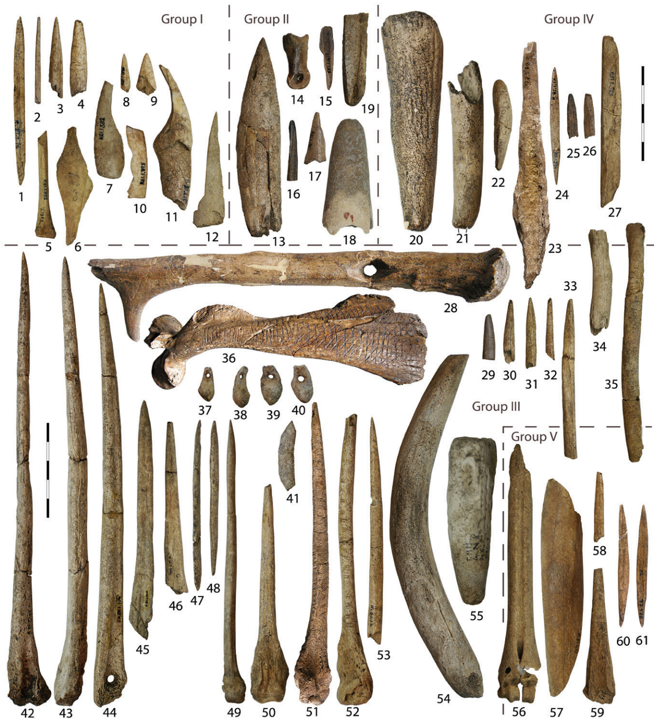
Fig. 93.1. Grouping of the Tévéc bone industry according to their taphonomic characteristics except for three pieces illustrated in Péquart and Péquart (1937, Pl. X:19, 21, Pl. IX:5) but not found in the collections; five bone awls (1937, Pl. XII:9–10, 15, 17–18) and a seal tooth illustrated and/or mentioned in the publication but not found in other museums (Graves A, B, E, and M; Grave L has no bone material) as well as all smaller shell beads and the large shed/unshed antler pieces were not available for this study. All anatomical identifications and photographs by Éva David.

Group I – Light coloured (light yellow brown), porous, rough-like cortex, vermiculated (12 pieces made from teeth and bones): 1: thin double bone point (no. R81.1.16); 2: tip end of a bone needle (no. R81.1.22); 3–4: tip ends of bone awls (nos. R81.1.18 & 390); 5: basal part of a bone awl (no. R81.1.385); 6: bone waste product (no. R81.1.224); 7: broken tooth