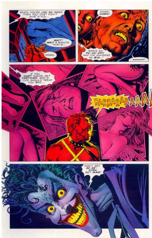
Picture 5. Page 26 of the original version, as edited, to compare with picture 6. BOLLAND, Brian (art), MOORE, Alan (story), HIGGINS, John (color). Batman: The Killing Joke . New York : DC Comics, 1988. ISBN 978-0-930289-45-4 (as reprinted in Absolute Batman: The Killing Joke . Burbank, CA : DC Comics, 2018, p.90).