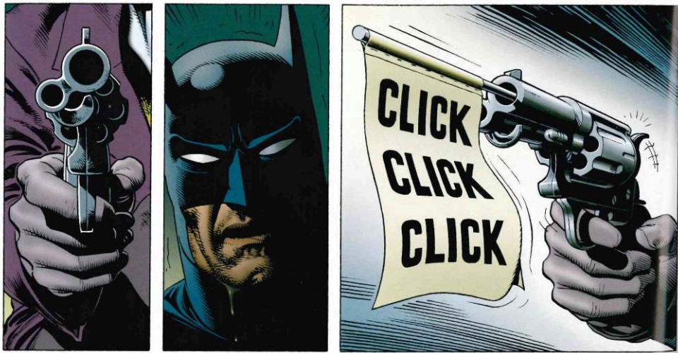
Picture 2. BOLLAND, Brian (art and color) et MOORE, Alan (story). Batman: The Killing Joke - The Deluxe Edition . New York : DC Comics, 2008. ISBN 978-1-4012-1667-2 (as reprinted in Absolute Batman: The Killing Joke . Burbank, CA : DC Comics, 2018, p.50).