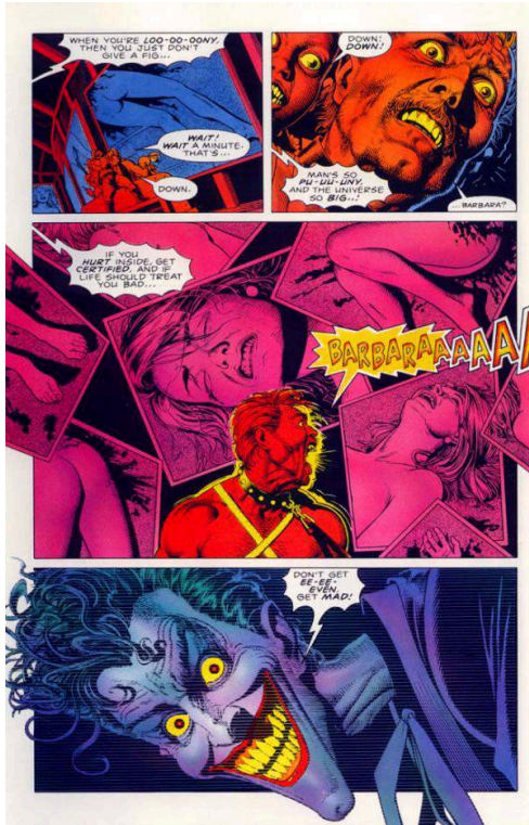
Picture 5. Page 26 of the original version, as edited, to compare with picture 6. BOLLAND, Brian (art), MOORE, Alan (story), HIGGINS, John (color). Batman: The Killing Joke . New York : DC Comics, 1988. ISBN 978-0-930289-45-4 (as reprinted in Absolute Batman: The Killing Joke . Burbank, CA : DC Comics, 2018, p.90).