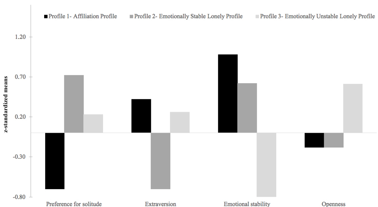
Three profiles based on personality variables