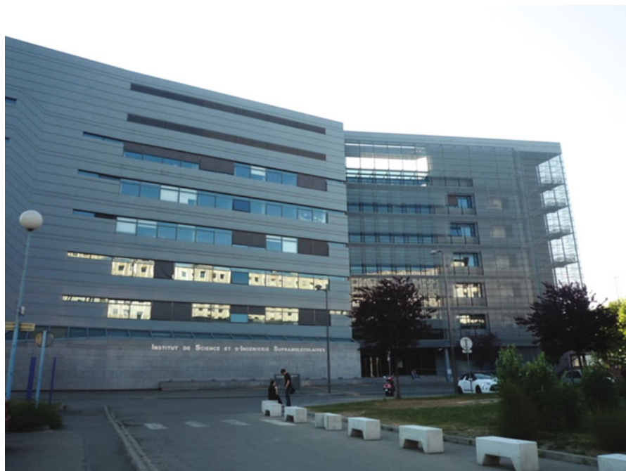
Fig. 2.2 The ISIS building at the University of Strasbourg

further development of his research, based on a vision he himself had defined: that of a scientific project incubator, where ‘the most brilliant young researchers in the supramolecular sciences will be able to express themselves freely, before pursuing their career in other research centres’. 32 This new institute signified a major achievement in his career and was thought of as an organisational innovation in the French research scene. It was supported by the Louis Pasteur University in partnership with the CNRS and funded by the local government.