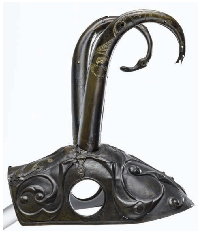
Fig. 3. The Torrs pony cap.

Good examples of the 'hidden zoomorphic' category are the brooch from Villeneuve-la-Guyard (Yonne) and a boss probably from the lower Danube, both with bird heads concealed in the decoration (Rapin, Baray 1999; Müller 2011). The Disney style shows a wide variety of creatures, real and imagined, from bulls to flamingos, owls, horses, humans, humanoids, and fantasy creatures such as those on the Rouissy disc (Megaw, Megaw 2001, p. 139-144; Olivier 2012, p. 110-113, fig. 28). The TWW Style which developed from Plastic Style is likewise covered with animals, both obvious and hidden. This includes bulls or horses at the ends of the Witham shield, but it is birds which dominate