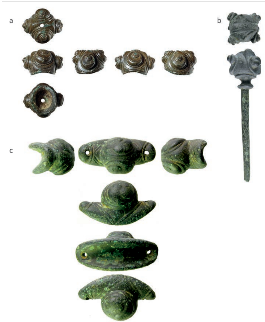
Fig. 1. Examples of Plastic Style from recent metal-detecting in England. a. Mount from Braughing, Hertfordshire. Length 19 mm (Portable Antiquities Scheme BH-B9C05B; © St Albans District Council). b. Fitting or pin with Plastic-Style head, Ropley, Hampshire. Head width 17 mm. (PAS HAMP-C319B7; © Winchester Museums Service). c. Mount from Micklefield, West Yorkshire. Length 38 mm. (PAS SWYOR-FEF701; © West Yorkshire Archaeological Advisory Service). Images licensed by Portable Antiquities Scheme under Creative Commons Licence, CC BY 4.0.