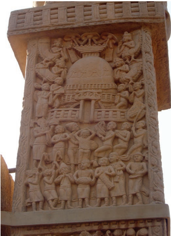
Fig. 7. Carnyx players on a stupa pillar at Sanchi, India.

in three broad phases (fig. 8; Hunter 2019, p. 333-338). Its origins probably lie in the heart of the La Tène cultural zone in western Europe, by 300 BC at the latest, arising most likely from local modifications of the concept of bronze trumpets inspired by the Etruscan or Greek world. Its fame spread east with military raids and mercenary service into the Hellenistic world, and as a musical instrument it travelled far beyond that.