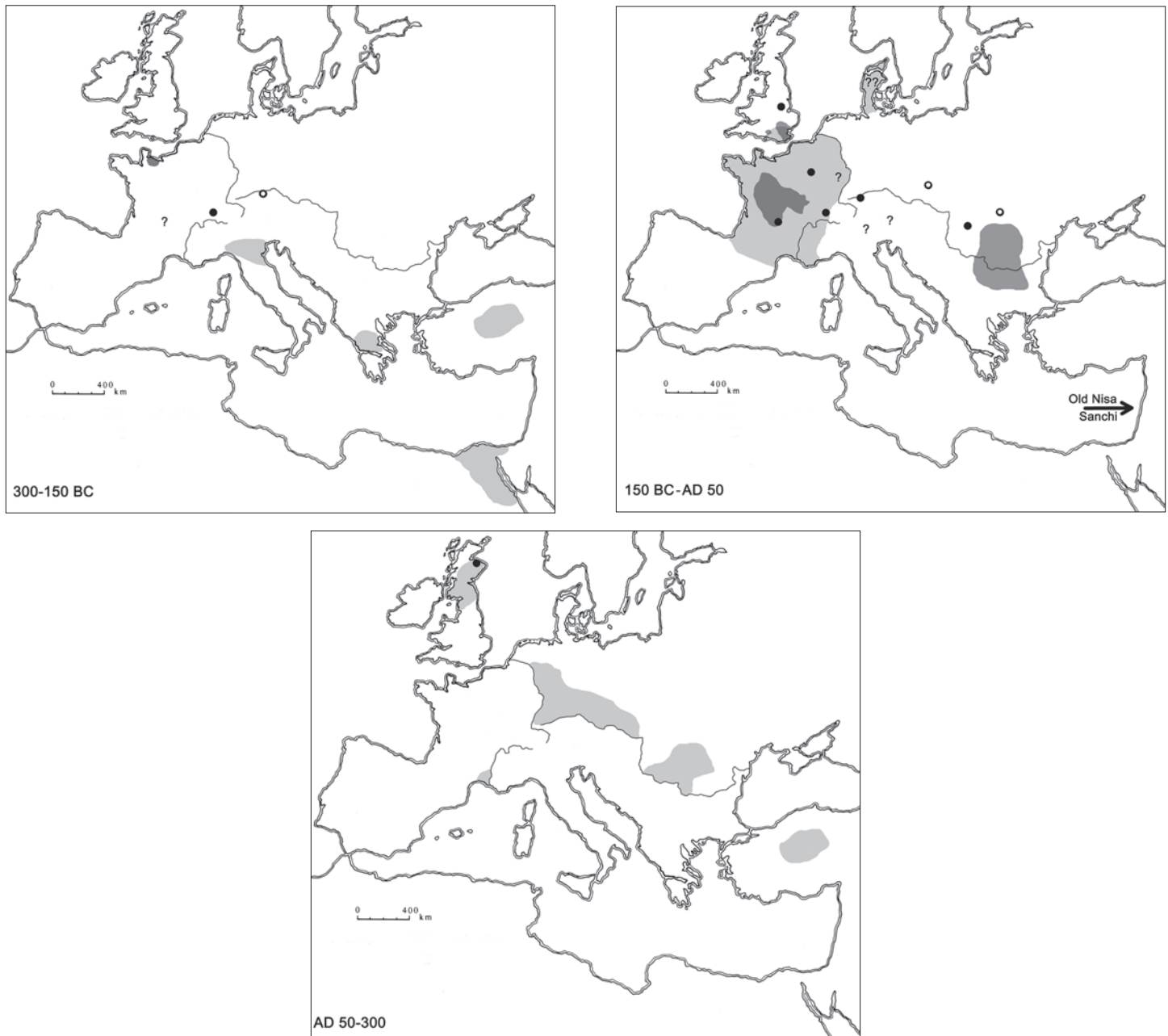
Fig. 8. Distribution of the evidence for the carnyx in three key phases. Black dots mark surviving examples, question-marks possible examples, open circles Iron Age representations. Light grey tone marks areas of use attested by classical iconography, dark tone by Iron Age iconography (coinage).

diversity across the rest of Europe, and a study of the Iron Age needs to consider the variabilities as well as the similarities. We need to consider things at regional scales, but also avoid being constrained by rather nebulous ideas of a 'Celtic world', as the evidence of Plastic-Style adaptations on torcs and other items in Denmark, and of carnyces in Dacia and India has shown. The two finds considered as starting points here, the Torrs pony cap and Deskford carnyx, need both local and international perspectives to understand them, and emphasise how both unity and diversity are critical to understanding Celtic art across and beyond Europe.