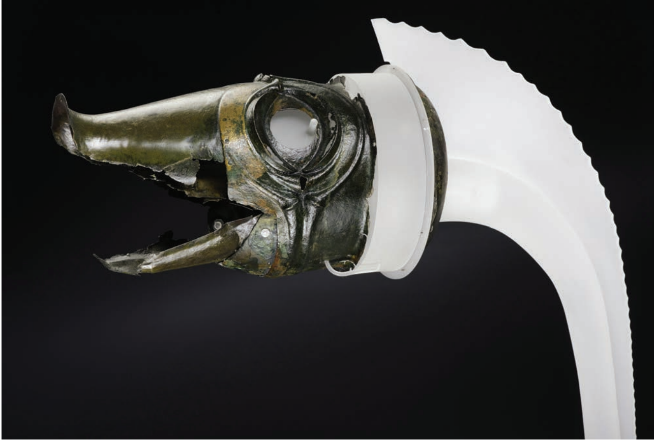
Fig. 6. The carnyx head from Deskford.