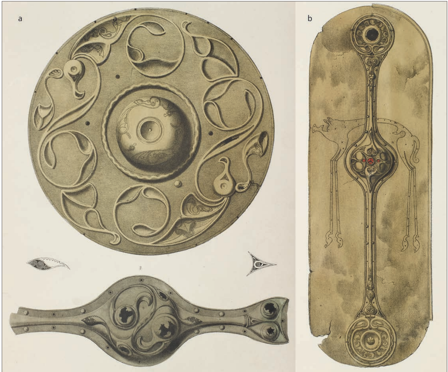
Fig. 5. Examples of Torrs-Witham-Wandsworth style. a. Shield bosses from the river Thames at Wandsworth, London. b. Shield cover from the river Witham, Lincolnshire. Images from Kemble 1863, plates XIV and XVI.

Surviving fragments are relatively few; although extensively distributed, they give only a partial picture of how widely the carnyx was known and used. Carnyces were depicted on coins and artefacts in the Hellenistic world, linked most plausibly to attacks on this area (such as the raid on Delphi in 279/278 BC) and to Celtic mercenaries serving Hellenistic kingdoms. Yet connections were more than just military. This is suggested by a frieze on the gateway to a Buddhist stupa at Sanchi in central India (fig. 7). Among the musicians in a travelling band are two carnyx players wearing distinctively non-Indian costume (Hunter 2019, p. 227-228, 555-557). This emphasises both the wide range of connections, far beyond the 'Celtic world', and the need to look beyond traditional explanations of warriors or mercenaries for such contacts. Other professions allowed people to be highly mobile in the Iron Age, and other events could lead to people, objects and ideas circulating.