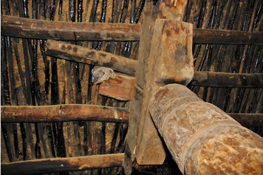
FIGURE 4 Main pillar (poplar wood) and a bracket made of willow. The purlin is made of poplar. The rafters and ceiling-covering sticks (called “ talu ”) are made of willow. The sticks are cut from poles of pollarded willows. Continuous lopping of the top of a tree encourages fresh growth into new shoots producing poles (Corkhill 1979).

and Buddhists had good relationships in the Old Town, living together in peace and harmony.”