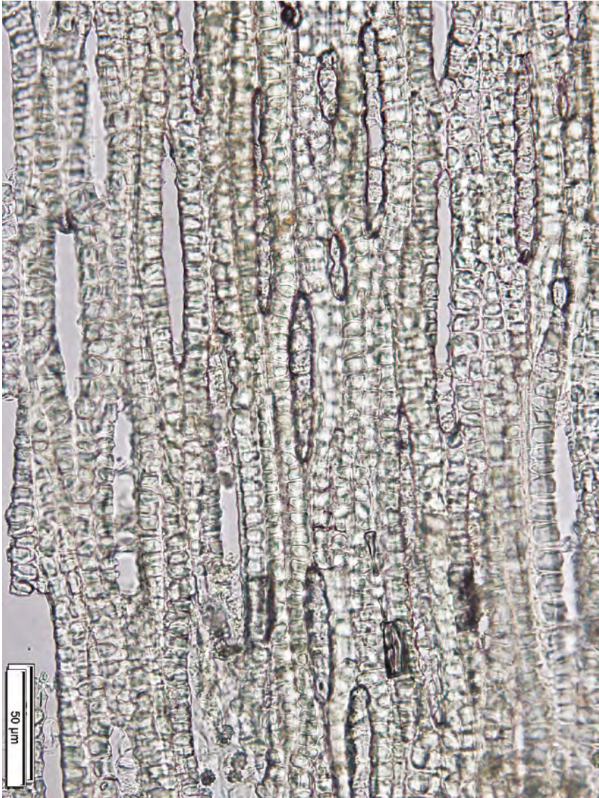
FIGURE 15 Sample No. 76 from Tsa Tsa Puri temple, room 3. Tangential section of poplar bark. The bark had remained attached to the roundwood sample. The rays are only visible as hollow shapes. The bark tissue is mainly composed of very long strands of chambered cristalliferous phloem parenchyma.