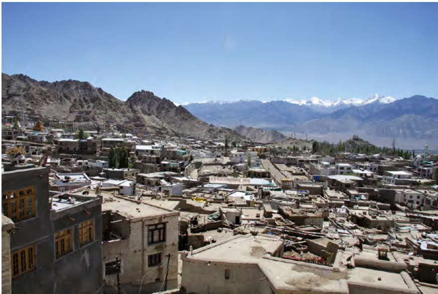
FIGURE 2 Old Town of Leh, capital of Ladakh (3505 m asl).

The collected wood samples were prepared and identified at the Research Institute for Sustainable Humanosphere (RISH) at Kyoto University. The