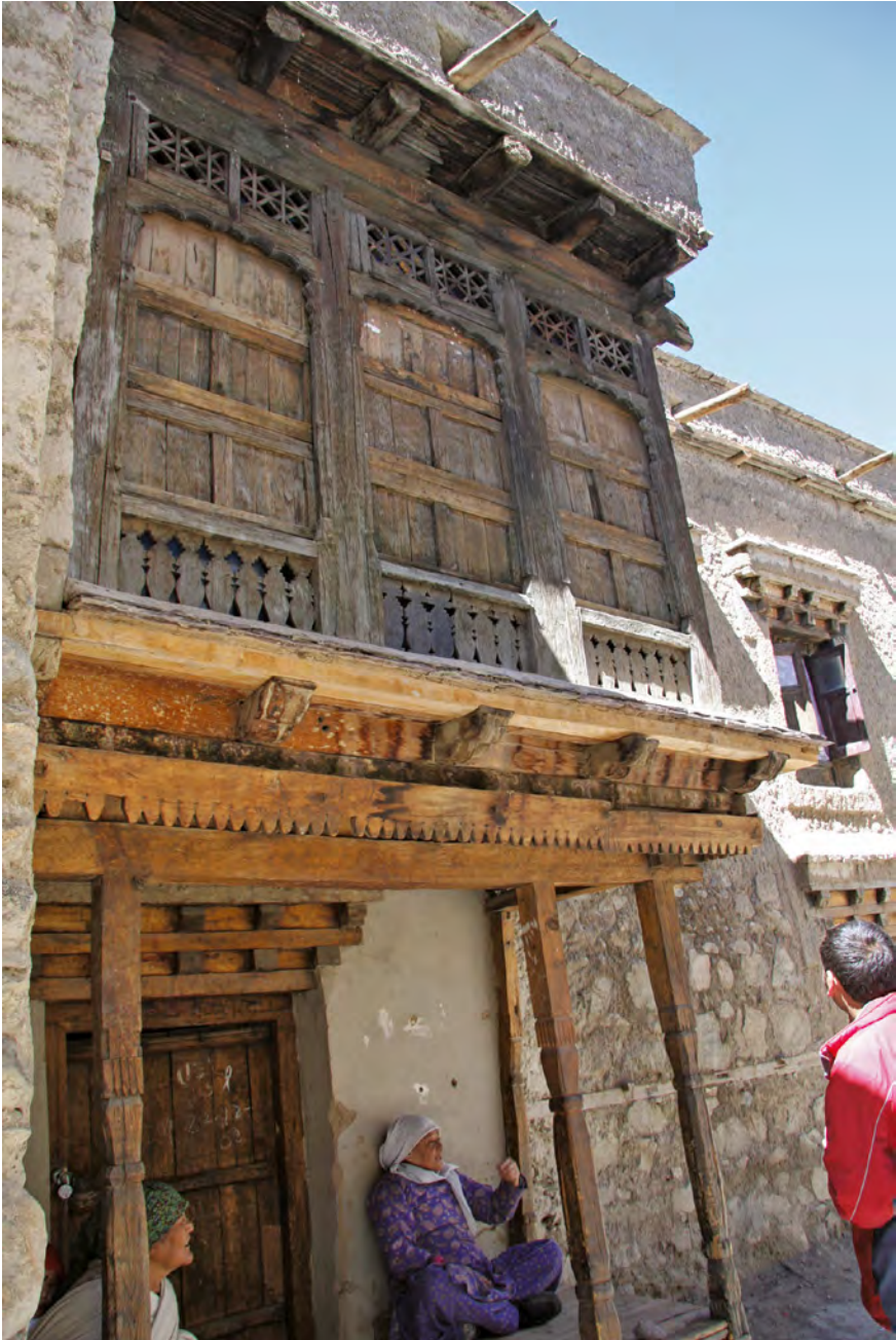
FIGURE 5 The Sofi House, dating from the early nineteenth century, shows the beautifully carved wooden doors and balconies typical of a Kashmir-style house. The rafters, beams, and pillars are made of poplar.