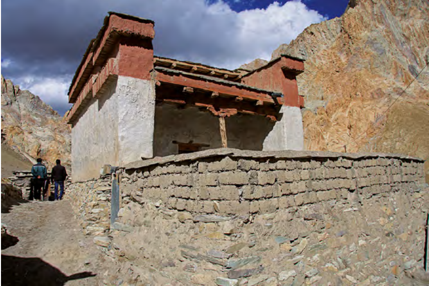
FIGURE 10 The Tsuglag-khang Temple dating from 1300 is located in Kanji Village on the Kong Tokpo River, a confluent of the Indus River. It is made of juniper.

(Bhaisajyaguru) and the green form of the goddess Tara. Its walls are covered with paintings, including six mandalas. Although the exact identification of these is not yet possible, the mandalas on the left-side wall are dedicated to the main Bodhisattva Vajrasattva and the Buddha of long life Amitayus, and those on the right-side wall to the Buddha Shakyamuni and Vairochana. On the entrance wall, the left mandala is damaged to the extent that it must be considered unidentifiable. The one to the right is dedicated to the fierce deity Vajrapani. Due to the quality of the interior decoration and its fragile state of preservation, this temple was selected by the Achi Association in 1999 as its first monument conservation project. The conservation problems mainly resulted from an overload of the structure accumulated over centuries of casual repairs. The heavy load caused instability and cracks in the walls and resulted in an outward drift and partial detachment of the east wall; in consequence, water penetration through the roof soiled and partly destroyed the precious paintings.