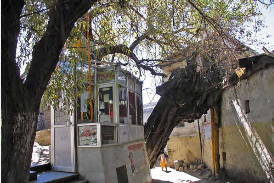
FIGURE 9 These two holy trees are impressive landmarks of Leh Old Town. The one on the right is dead and the one on the left is living; both are poplar trees.