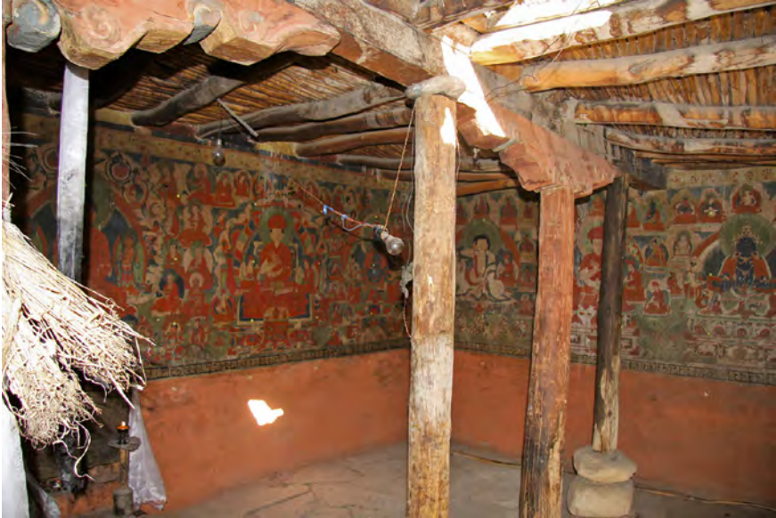
FIGURE 14 Interior of the “Old Temple” showing the wooden structure and the wall paintings slated for restoration. The wood identifications revealed that most of the structural timber is poplar, while some rafters are made from willow.

with our arrival. First, the responsible priest performed a purification ritual. Then, the THF team started consolidating the wall paintings while the artisans, carpenters, and masons prepared wooden boards for new doors, and soil for plastering. During these activities, the wood sampling was performed.