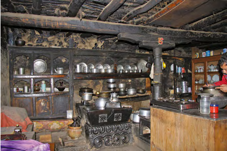
FIGURE 7 Interior of the Lakruk House dating from the early 1700s. It belongs to a Buddhist family. The whole inner structure appears to be made from poplar, with the exception of the ceiling sticks (“ talu ”) made from willow.