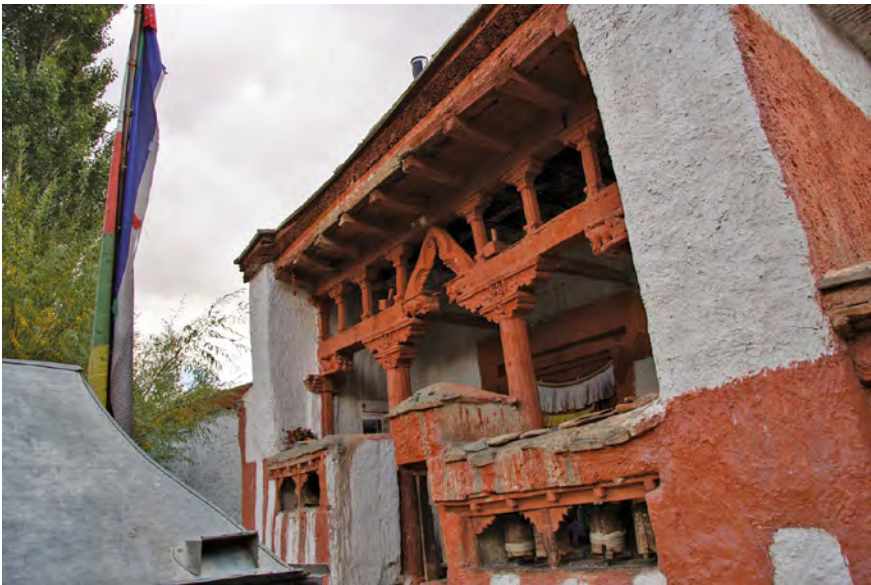
FIGURE 11 The Chuchig-zhal Temple of Wanla Village dates from ca. 1300, and is located on the Yapola River, a confluent of the Indus River. The pillars are made of Pinus wallichiana and the beams of willow.

The temple of the Eleven-headed Avalokiteshvara (Chuchig-zhal) was built about 700 years ago within the hilltop fortress of a local ruler, Bhag-dar-skyab.