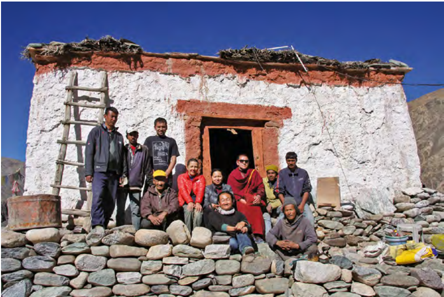
FIGURE 13 The Tibet Heritage Fund team together with the carpenters and masons before starting the restoration of the “Old Temple” of Chumathang village, located on the upper Indus River (4 October 2014).