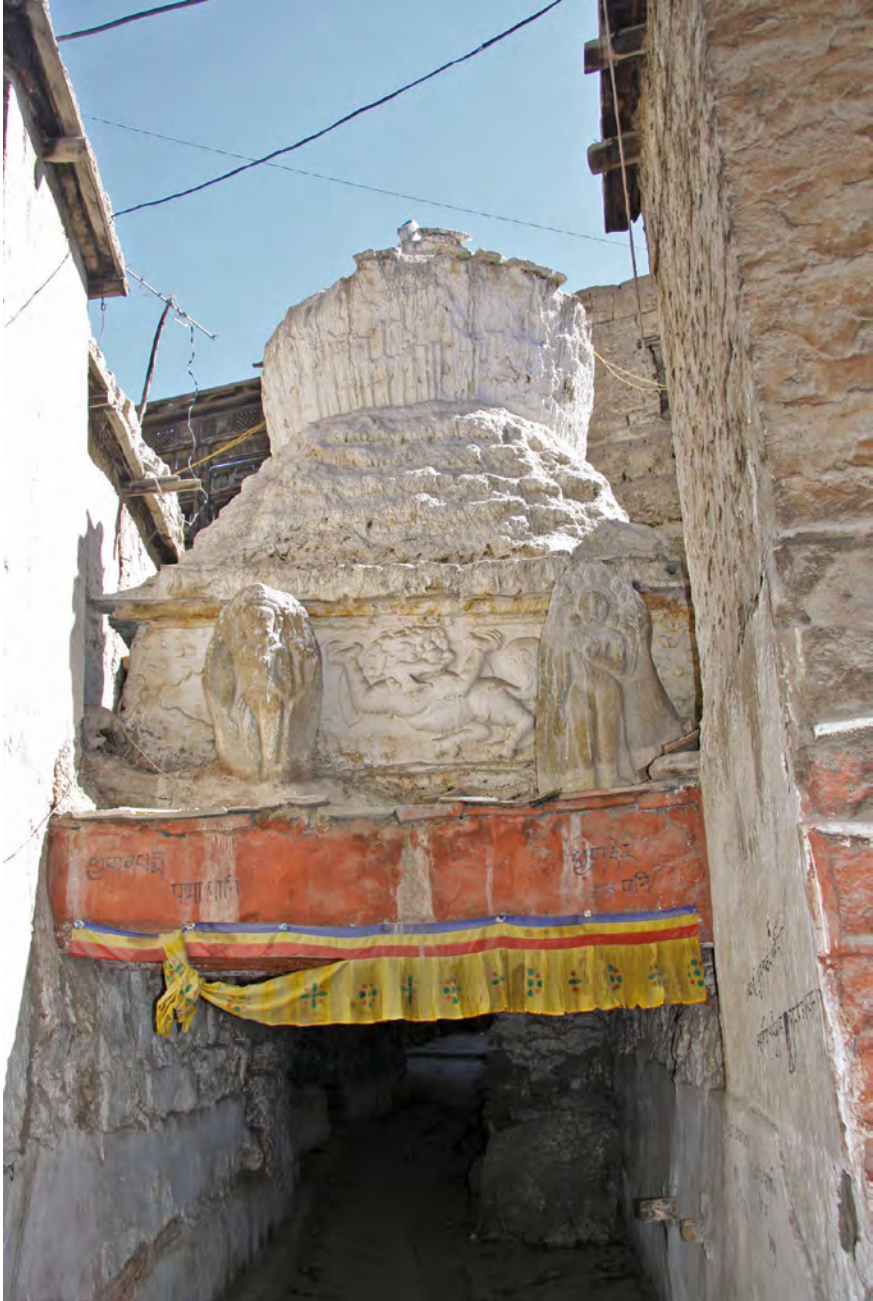
FIGURE 8 West Stupa Gate squeezed between two houses.