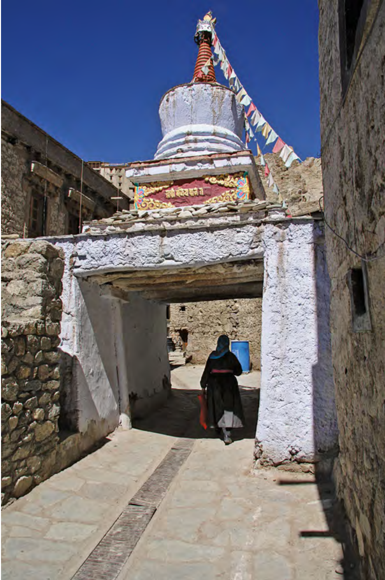
FIGURE 6 Stagopilag Stupa Gate, located next to the Sofi House (left). One beam of the ceiling is made of willow.

This is a small gate in the form of a stupa, or chorten in Tibetan, above a small street next to the Sofi House. A stupa, or chorten , is a mound-like hemispherical structure containing relics, typically the remains of Buddhist monks and nuns, that is used as a place of meditation.