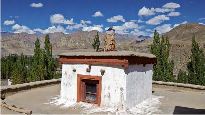
FIGURE 12 The Tsa Tsa Puri temple, located in Alchi next to the Indus River, probably dates from the fifteenth century. The temple is mostly made from poplar, while the floorboards are made of juniper.