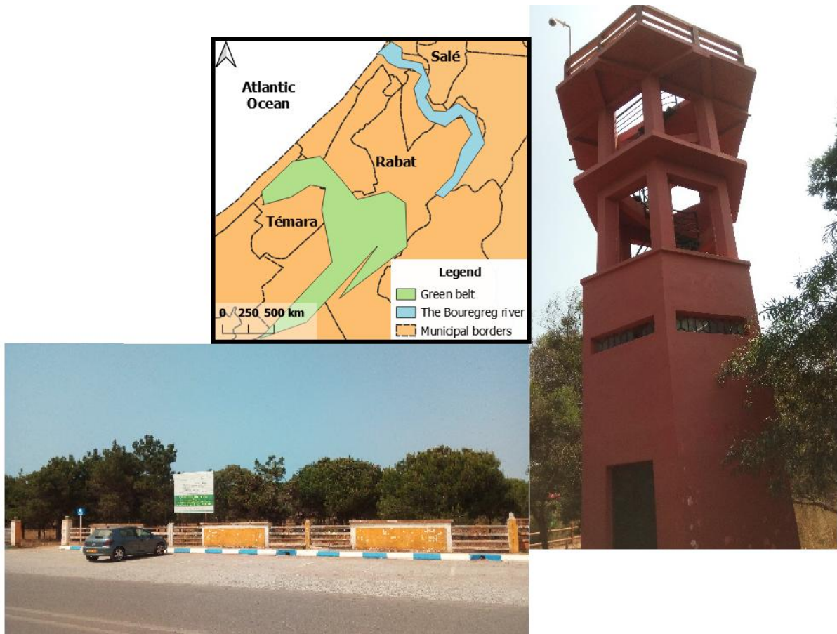
Figures 3 and 4. The urban forest as a military tool.

Notes: the fence surrounding the green belt (left) and a watchtower in the forest (right)