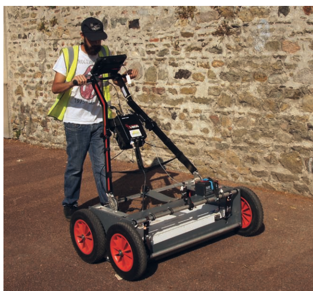
Figure 1. Geophysical devices used during the survey: a) Electrostatic “sliding carpet”, b) Electrostatic MP3, c) IDS Georadar (Stream X V8).