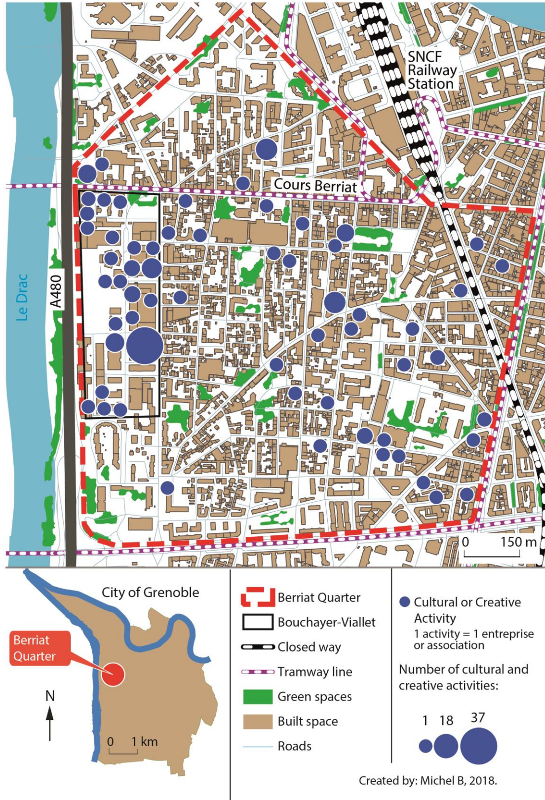
Fig. 1/ Location of the cultural and creative activities of the Berriat district

Cours Berriat and Saint-Bruno Square. Their presence offers sites suitable for the development of a vibrant social life in the neighbourhood. Consequently, it is often called a “village” by its residents and other users (Szántó, 2004; Michel, 2018b).