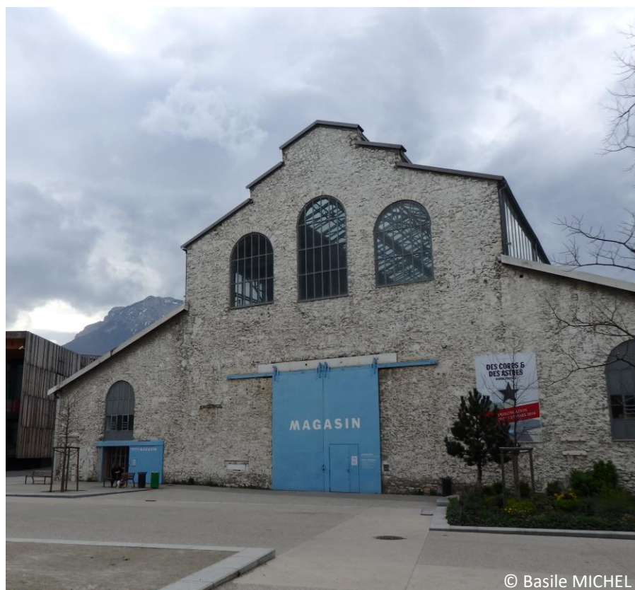
Photo 1/ National Centre of Contemporary Art: Le Magasin in Berriat