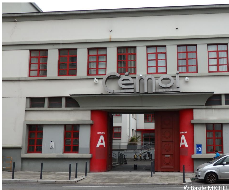
Photo 4/ The renovated Cémoi building in Berriat