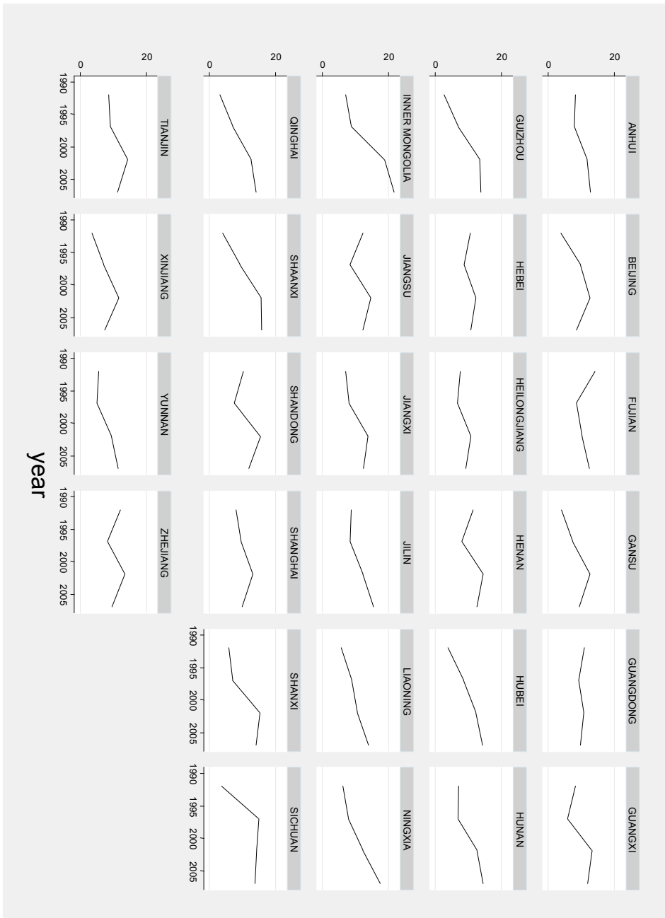
Figure 1. Five-year average growth of real GDP per capita by provinces (in percentage)