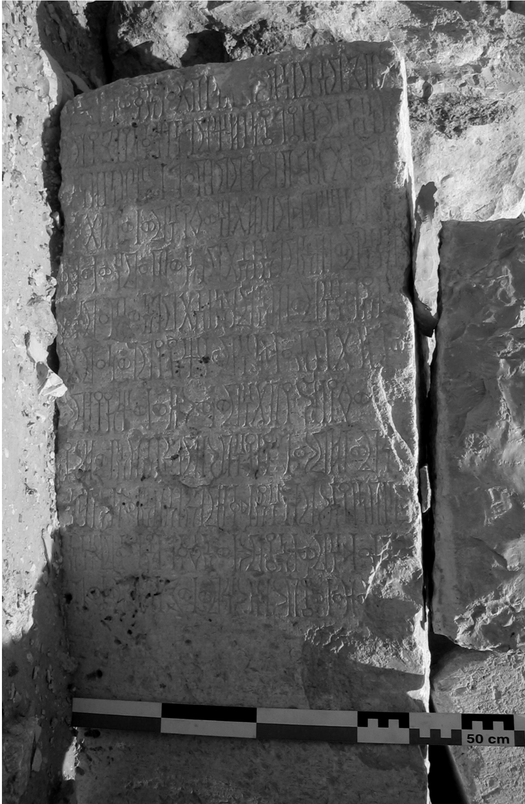
Figure 2: Inscription Jabal Riyām 2006-19 (J. Schiettecatte).