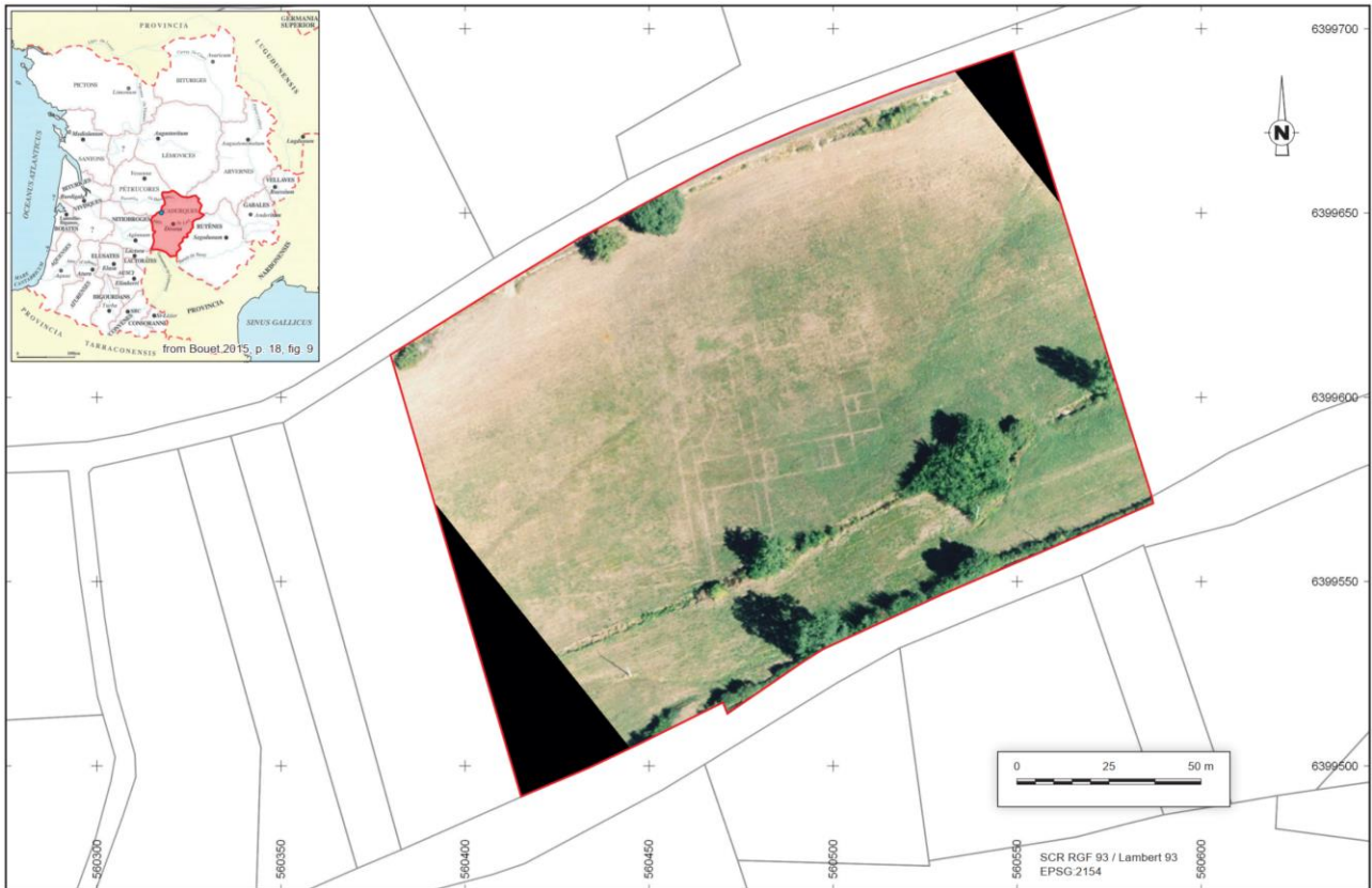
Figure 1: Discovery of the Plantades settlement in 1987. Rectified aerial view showing up negative cropmarks superposed above cadastre. Inset: location of the site – blue dot - within the Gallic tribe of Cadurques – in red- in South-West of France.