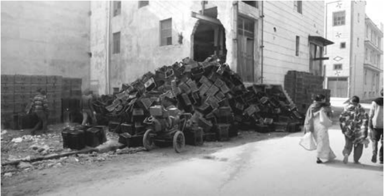
Fig8: final product after molding: recycled plastic boxes