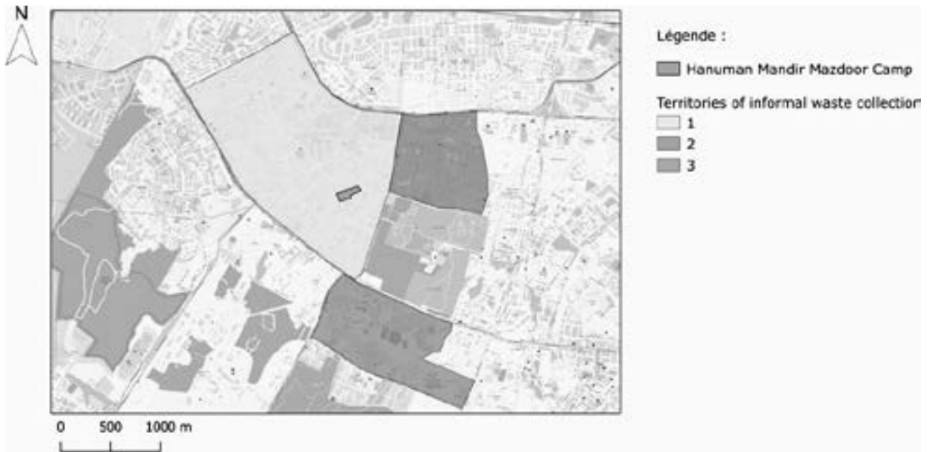
Figure 2: territories of waste collection around the slum of Hanuman Mandir Mazdoor Camp (one of the many slums in Delhi involved in waste collection)