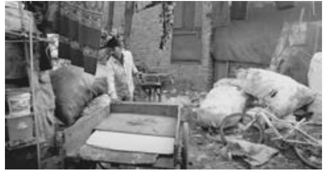
Fig.4: at home