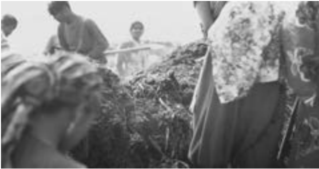
Fig 5: Incinerator bottom ash and ferrous metals