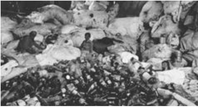
Figure 3: women at work at PVC Market