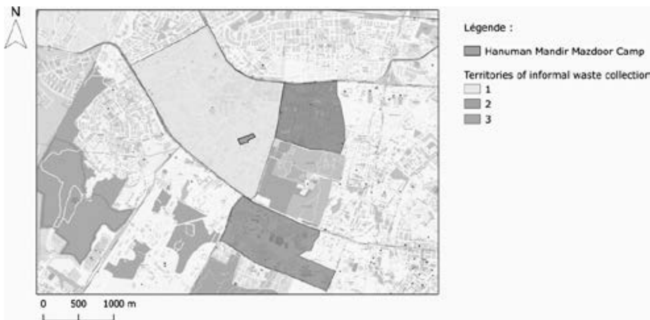
Figure 2: territories of waste collection around the slum of Hanuman Mandir Mazdoor Camp (one of the many slums in Delhi involved in waste collection)