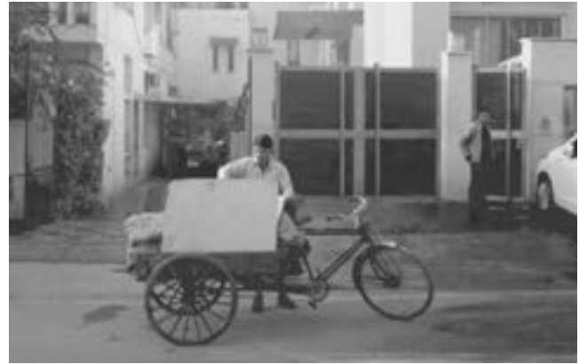
Figure 1: a waste picker collecting waste in his rickshaw from a wealthy neighbourhood in South Delhi

On the above map, the slum of Hanuman Mandir Mazdoor Camp appears at the centre of the collection system of a wealthy neighbourhood of South Delhi. Populated by about 1500 inhabitants, the slum owes much of its population's survival to the daily recuperation of waste generated by neighbouring residential areas within a 2km radius of the slum. The three large kabari-wala of the slum have divided the three informal collection areas into (1) Rama Krishna