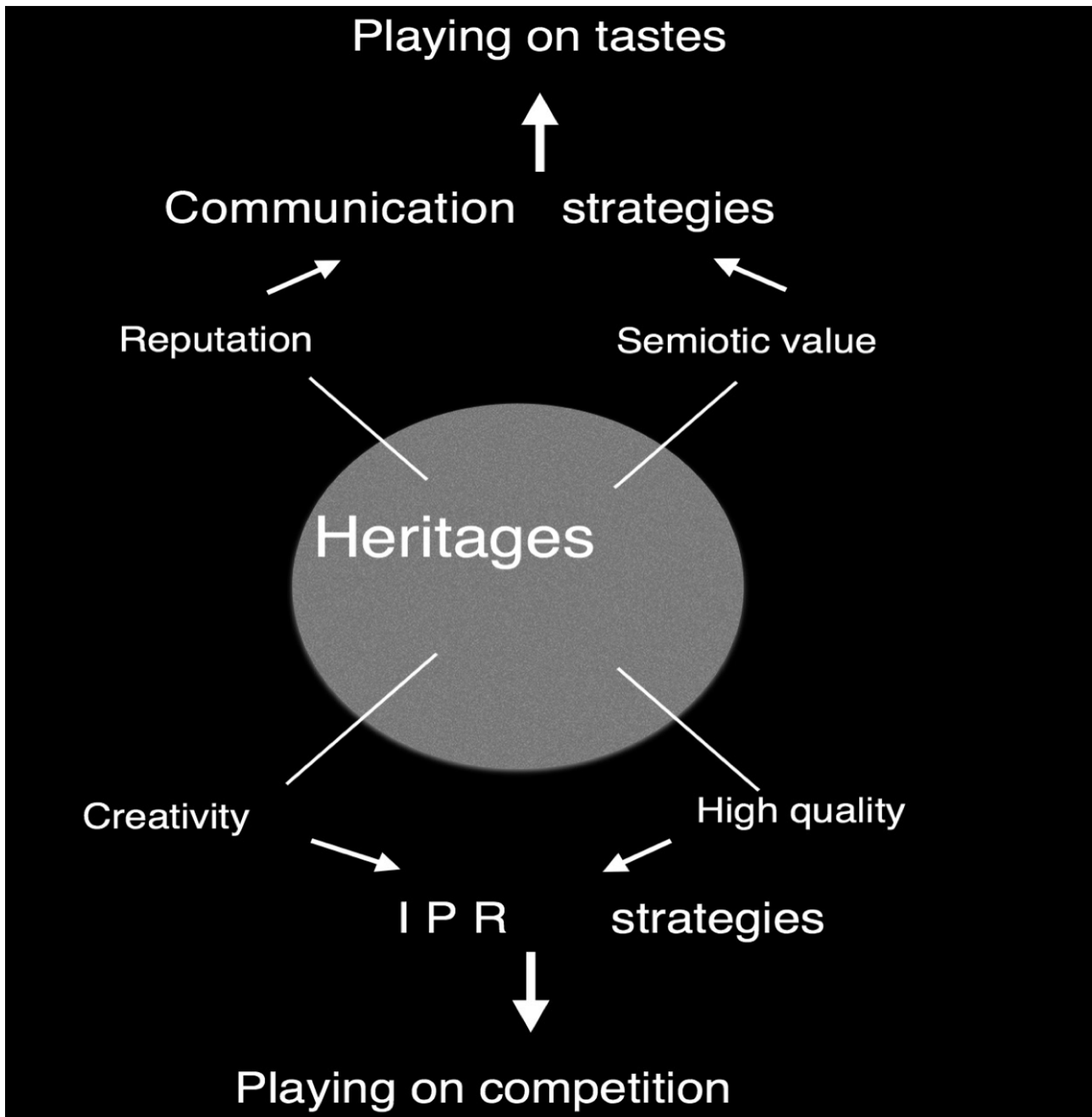
Fig. 2 – The accompaniment strategies.

The trends analysed by the Frankfurt School now concern the area of tastes. They can also be related to the Chamberlin's framework. As Keynes did, but regarding the micro and meso-level, Chamberlin (1933) focused