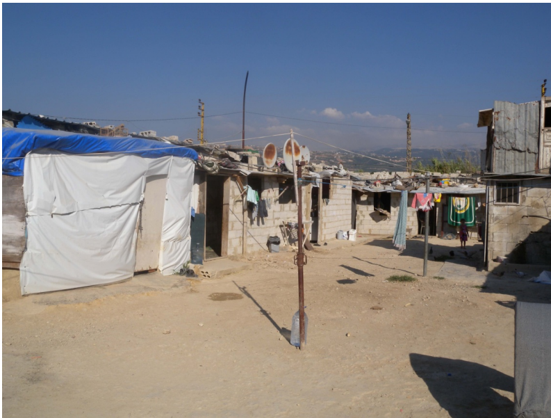
Figure 4: Breezeblocks Camp in Zgharta Countryside