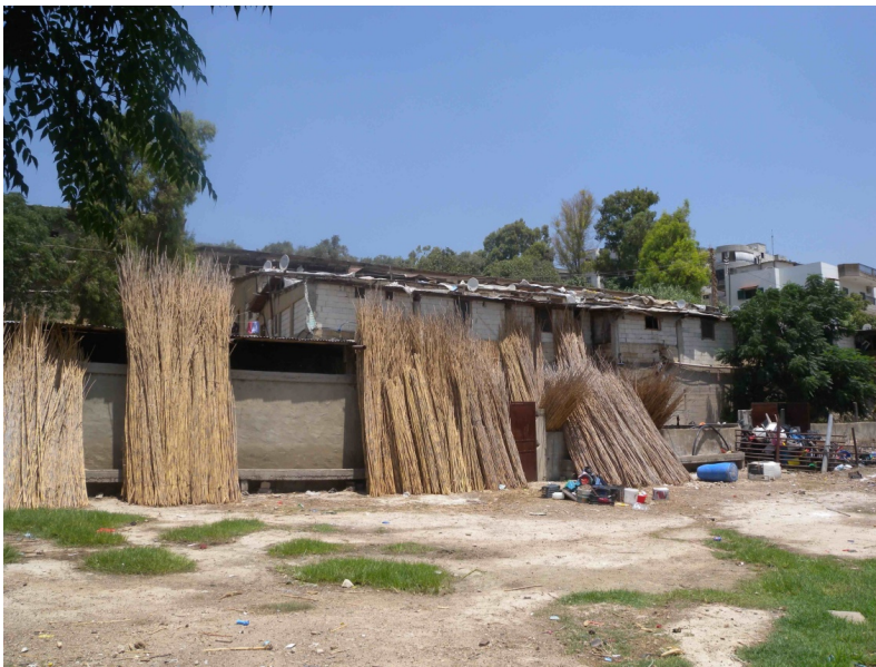
Figure 2: Syrian Refugees' Accommodations in Former Chicken Farm Buildings in Zgharta

mainly, a chicken farmer. So, there are 25 families from Ahmad's village who have gathered in Zgharta, most of them belonging to the same lineage. After being expelled by Zgharta municipal authorities from their first settlement, an empty store on the street, Ahmad, as one of the leader, had negotiated with the chicken farmer in order to transform his unused farm buildings into accommodations (figure 1). In 2016, families have subdivided the buildings into small units and rent each part around 100-150 US dollars per month.