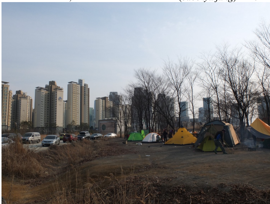
Figure 6: Photo of the barbecue area ( babekyu jang ) in 2014 28