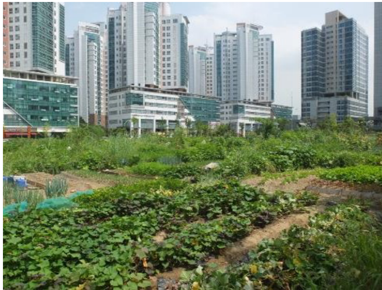
Figure 7: © Valérie Gelézeau, photo of the Vegetable Gardens in je-l gonggu in 2016 30

a capacity for self-management of the city. Moreover, this urban development could mean the creation of a game-changing public space contrasting with the top-down ideologically planned space. Nonetheless, even if the camping/picnic areas and gardening have continued to subsist (as of 2019), people using them seem to come from outside of Songdo.