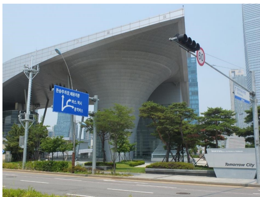
Figure 4: © Valérie Gelézeau, photo of “Tomorrow City” in 2016 24

Building a mega-project from scratch involves planning, which means that it develops in a manner different from that of an organic city built over time. A mega-project thus requires heavy marketing to hide its current state. For Songdo, being “smart” is not just a new means of adding to the city’s attractiveness, as could be said to be the case for London with the Canary Wharf (Murry 2015). Rather, being smart has to do with Songdo’s very model of conception. Planners believe that smart-city tools and the collection of big data will suffice to generate a successful organic city from scratch. However, there are discrepancies between the idea of the smart city and what has actually been built. For a new city, time passes differently. The narrative about Songdo has been accelerated to produce the image of being organic: keywords such as