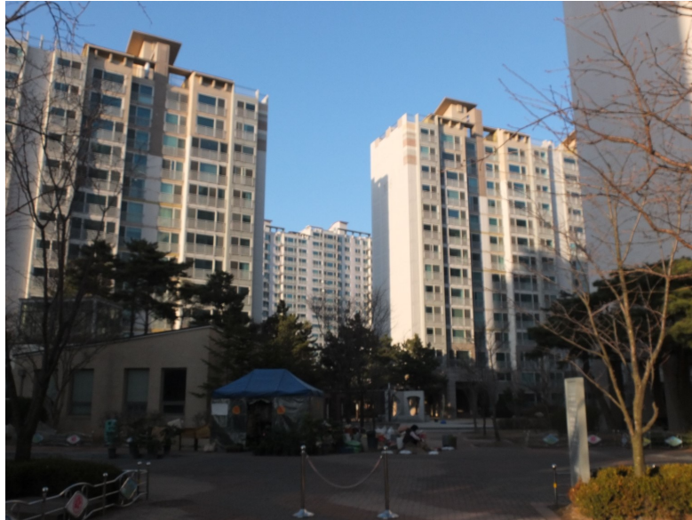
Figure 3: photo of the Temporary Market near the Entrance of I Park Apartments 21

We must emphasize that the city is incomplete, presenting the characteristics of a city in the making. In 2014, for example, less than fifty percent of the overall development project of Songdo was completed, and less than thirty percent if actual economic activities and services, not just land and construction, are taken into account. Still, in 2020, around eighty-five percent of the land reclamation has been completed while less than fifty percent of planned construction has actually been completed. 22 Beyond the first two building areas ( je-1 gonggu and je-2 gonggu ) that were reclaimed in the early 1990s, the whole city is in the making, and some areas are even still under reclamation in 2020 such as the remote campus zones. This morphological discrepancy between planning and reality has arisen because urban development includes different dynamics, different actors, different problems, and delays for each plot. As a result, important stocks of underdeveloped lands can lay as idle areas for periods of time that are difficult to determine.