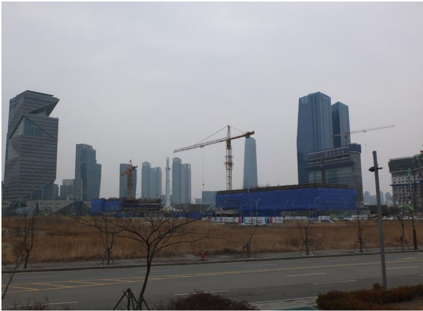
Figure 5: photo of the IBD Under Construction in 2014 27