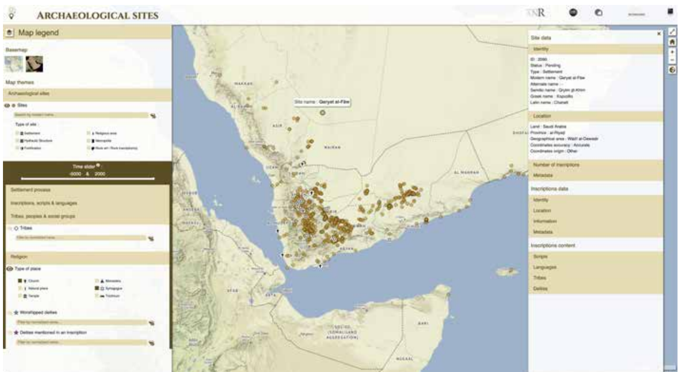
Fig 1. Screenshot of the online digital atlas interface (Maparabia project/CNRS/CNR/Cartodia).

It is a 5-year project funded by the French National Research Agency (ANR-18-CE27-0015, PI J. Schiettecatte), 2019-23, which encompasses a variety of fields of research: history, archaeology, epigraphy, linguistics, palaeography, geomatics, and geography. The fifteen members of the project come from four laboratories dedicated to pre-Islamic Arabia: CNRS-Orient & Méditerranée (Paris), CNRS-Archéorient (Lyon), Dipartimento di Civiltà e Forme del Sapere of the University of Pisa, and CNR-ISPC (Milan).