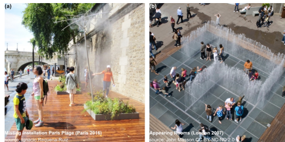
Figure 4. Examples of climatic stage settings: (a) clouds; and (b) pop-ups.

In more general terms, climatic stage settings appear as an urban staging approach to the public space, in which climate effects prevail over material ones. The space becomes the canvas for collective or individual intangible climatic effects that are spontaneously recognizable by citizens.