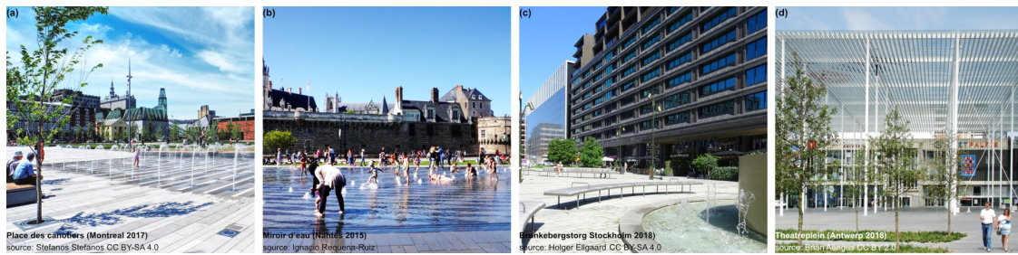
Figure 2. Distribution of the inventory's reference types and subtypes: (1) Microclimatic plazas; (2) Climatic capsules; (3) Climatic stage settings; (4) Cooling street furniture; and (5) Non-classed items.

trees, or the intensification of the urban experience through multifunctional open public spaces (Stanislav and Chin 2019).