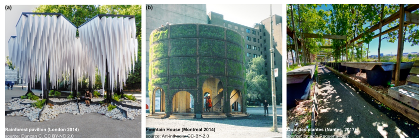
Figure 3. Examples of climatic capsules: (a) tents; (b) vessels; and (c) tunnels.

In more general terms, climatic capsules recall the landscaping perspective of the pavilion or garden “follies” and introduce a climatic dimension to it, sometimes to create pleasant situations, sometimes shelter. This type contributes to the construction of the thermal representation of the city structured in nodes, paths and edges, which enrich to the visual structure of the city (Lynch 1960).