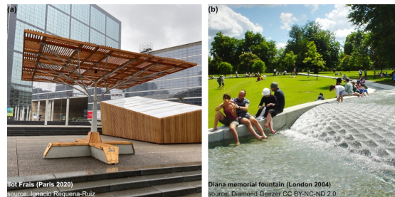
Figure 5. Examples of cooling street furniture: (a) canopies; and (b) platforms.

contributes to the thermal experience of the city with a body-scale climatic approach. Urban cooling techniques integrate street furniture in meeting the challenge of increasing comfort whilst creating a strong identity and a qualitative perception of the public space.