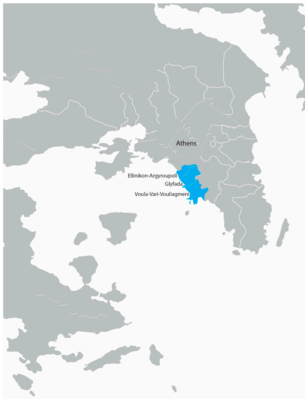
Figure 2. Location map of the Greek case study area.

The comparative analysis in this paper was based on a mixed-methods approach; that is, both qualitative and quantitative methods were used. While quantitative methods and data provided a better understanding of the scale of the phenomenon and its evolution through time, qualitative methods and data allowed us to put it into context and, in turn, validate and interpret the quantitative evidence collected. We combined the review and analysis of policy documents and legislation with descriptive statistics and calculations based on primary and secondary data, as is appropriate and proven fruitful in this topic [22,42–44]. Primary data on the square meters of legalised property and associated fines were collected in the case of Athens from the Technical Chamber of Greece, which, by law, manages the system for the registration of informal/irregular structures and fine collection for the legalization, on behalf of the Ministry of Environment. Property prices in