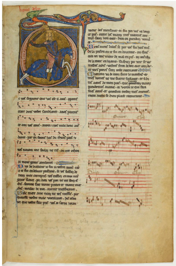
Figure 1: BnF, fr. 844, fol. 29 ( manuscrit du roi ), beginning of the section for the texts of the count of Bar.

To answer these questions, we propose to experiment in the cross examination of the text, the metrical composition and the melodies of a corpus of lyrical texts with the methods of computational stylometry. We will focus on the Manuscrit du Roi (Paris, BnF fr. 844), one of the earliest (1260-1270) and richest sources for Romance lyric poetry with its 602 compositions. The literary, musical and linguistic diversity of its contents (profane songs of French trouvères and Occitan troubadours, French motets, instrumental works and Latin sacred compositions) makes it a unique case-study.