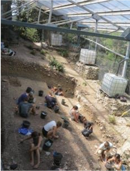
View of the excavations at the entrance of Grotte Mandrin.

The site, recognized in the 1960s and named Grotte Mandrin after French folk hero Louis Mandrin, has been a valued location for over 100,000 years. The stone artifacts and animal bones left behind by ancient hunter-gatherers from the Paleolithic period were quickly covered by the glacial dust that blew from the north on the famous mistral winds, keeping the remains well preserved.