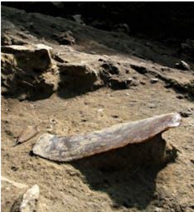
View of a long flint blade emerging from the sediment of Grotte Mandrin.

Archaeological evidence from Australia shows that modern humans reached that continent by as early as 65,000 years ago. Of course they would have needed a boat to cross the open ocean to get there. It therefore isn't a stretch to assume that people in the Mediterranean had access to boat technologies 54,000 years ago and used them to explore along the coastlines of this contained sea.