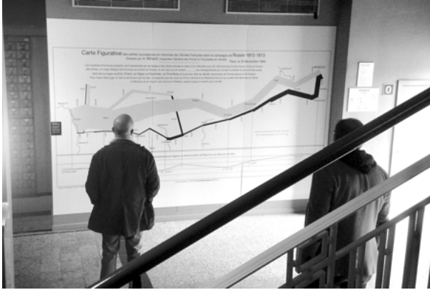
Fig. 1: Visitors in front of a giant reproduction of Minard’s 1869 map at the Mundaneum, in Mons (Belgium).

century to “graphic semiology”, 11 the modes of representation have evolved and stabilized. In this field, their use remains nevertheless relatively descriptive and heuristic data visualizations are still rare.