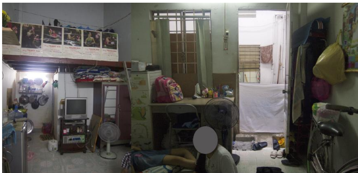
Fig. 4. A rental room occupied for 12 years by a married couple and their 11-year-old daughter, in Go Vap district, Ho Chi Minh City. Photo by the author, June 2020

the rent or to provide basic food supplies in times of need, like during the Covid-19 pandemic. These informal transactions, included in a broader informal system of capital circulation, establish bonds between people [Pannier, Pulliat 2016: 116], financial bonds as well as personal ones. Meanwhile, for migrants working in the industrial sector, salaries increase yearly making it disadvantageous to quit the company. In these conditions, over the years, the phòng trọ can be personalized and adapted to a relatively higher standard of comfort when the financial conditions allow it. Hence, some phòng trọ have been decorated and gradually equipped by their tenants to include storage furniture, desk, TV, fridge, fan or AC (Fig. 4).