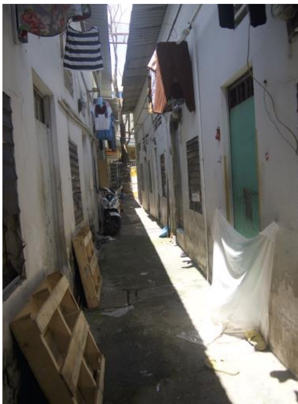
Fig. 3. Ranges of rental rooms in Go Vap district, Ho Chi Minh City. Photo by the author, June 2020

Tenants rent the rooms on a monthly basis. For the nhà trọ observed in the study sites, the rental price is usually set between VND 0.9 and 2.5 million (around USD 40–110), depending on the standard of the room. A few bigger and more expensive rooms have been found. Comfort criteria include surface area, natural light, condition, and location. Housing located in a street is more expensive than housing in an alley. Electricity and water fees are to be added, based on the rate applied to this specific housing and the consumption of the tenants, totaling a few hundred thousand Vietnamese dong. The amount dedicated to housing usually ranges from VND 1 to 3 million (USD 45–135), so that it fits into the budget of the informants who commonly earn between VND 4 and 8 million per person per month (USD 175–355). On the study sites, the most common cases of cohabitation are married couples, often with children, sometimes two roommates, and rarely one single tenant.