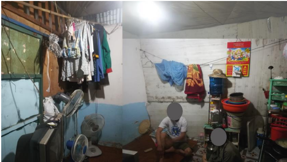
Fig. 5. A rental room occupied for 10 years by an elderly couple in Go Vap district, Ho Chi Minh City. Photo by the author, August 2020