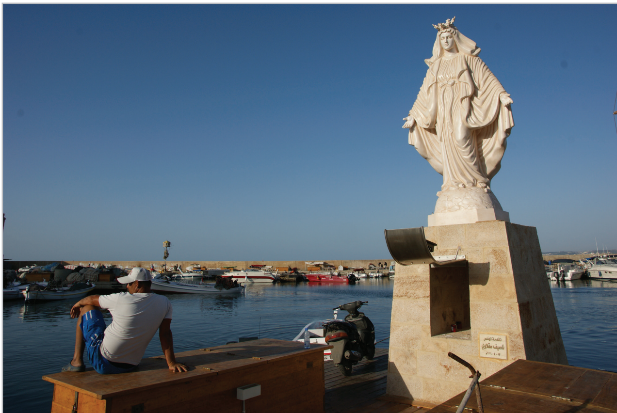
Fig. 5- The Blessed Virgin Mary, patron saint of the Old Port of modern Tyre.

We will not hide the provisional nature of the proposals made in this study. New discoveries will perhaps clarify, complete or even contradict these suggestions in the future. The investigation outlined here was intended above all as a contribution to the work in progress on the ports of Tyre. Far from closing the case, it should be continued by taking into account both written and archaeological sources.