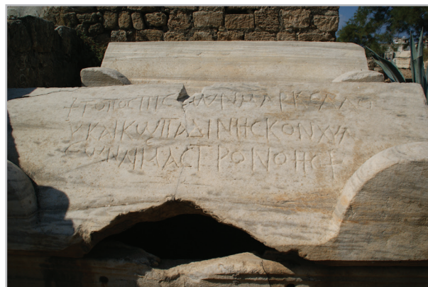
Fig. 2- The Byzantine necropolis in Tyre: sarcophagus lid of Markellos and Kopadine, murex fishermen of the port of Astronoe.