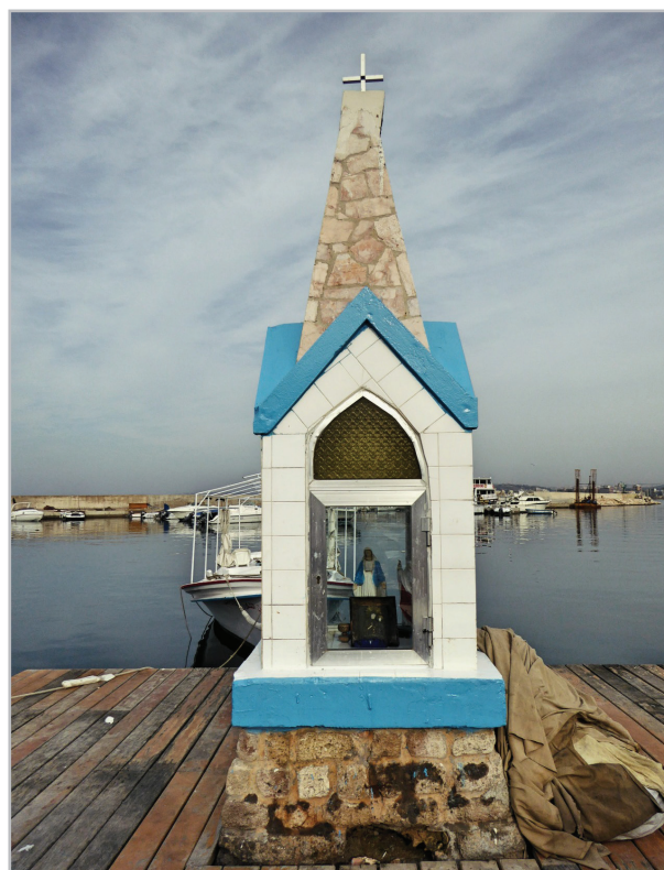
Fig. 4- Christian oratory in the Old Port of modern Tyre, 2015.

Mother of the gods and lover of one of the Dioscuri, protectors of sailors, Astronoe was the object of special attention from civic authorities and from Tyrian dignitaries, which explains why her name remained associated with one of the two main ports of Tyre in the early Byzantine period, in the formal toponymy as in the popular language of murex fishermen. The persistence of this appellation in no way implies that her cult continued to be celebrated in the fifth and sixth centuries AD. On the other hand, it raises the question of the evolution of religious traditions linked to the northern port, where a small Christian oratory ( fig. 4 ) was replaced in 2016 by a huge statue of the Virgin ( fig. 5 ), dedicated on the eve of the Assumption during a ceremony organized by the fishermen's union (on the cult of the Virgin Mary in Tyre in modern times, and particularly among fishermen, see Goudard and Jalabert 1955: 23, 24).