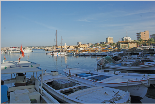
Fig. 1- The Old Port of modern Tyre.

The pair that the northern and the Egyptian harbours already formed under the reign of Alexander the Great shows up again in the Greek and Latin accounts of the siege of the city by the Macedonian conqueror (332 BC). Whereas the Latin historian Quintus Curtius only vaguely referred to the portus of Tyre (IV, 4, 9 and 12), Diodorus of Sicily sometimes mentioned one port (XVII, 42, 2; 43, 3), sometimes an indeterminate number of ports in Tyre (XVII, 42, 4). Arrian of Nicomedia (second century AD), depending on another tradition, was much more specific in his Anabasis . He made a clear distinction between a first port open to Egypt (II, 24, 1) and a second harbour turned towards Sidon (II, 20, 9; 20, 10; 21, 8; 24, 1). However, at no time did he suggest that the phrase he used to describe the port turned towards Sidon corresponded to an official name. Similarly, when Arrian dealt with the rampart located 'on the side of the city which looks at Sidon' (II, 22, 6), and again in the passage where Alexander was transported 'on the side of the rampart exposed to the south wind and facing Egypt' (II, 22, 7), no one has ever thought (and rightly so) that it would be relevant to speak of a 'Sidonian' or an 'Egyptian rampart'. This point must be strongly stressed, because all the archaeological literature refers to the northern port of Tyre as the 'Sidonian port', quite abusively in my view.