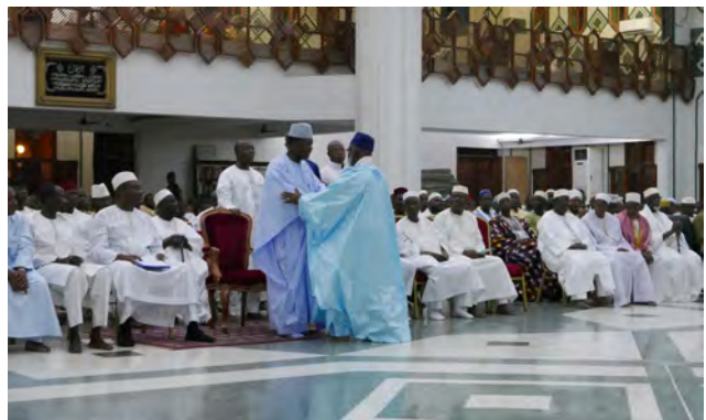
3.