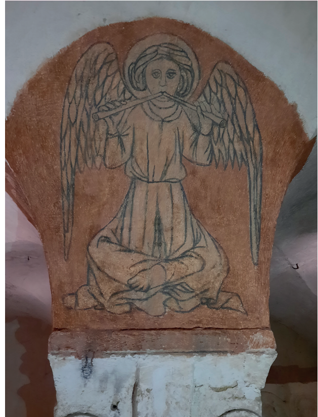
◆ Angels playing musical instruments in the mural paintings decorating the vaults of the crypt from the Cathedral of Our Lady in Bayeux (Normandy, France), 15th century.