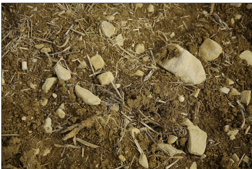
Figure 5 Credit: C. Guinchard.