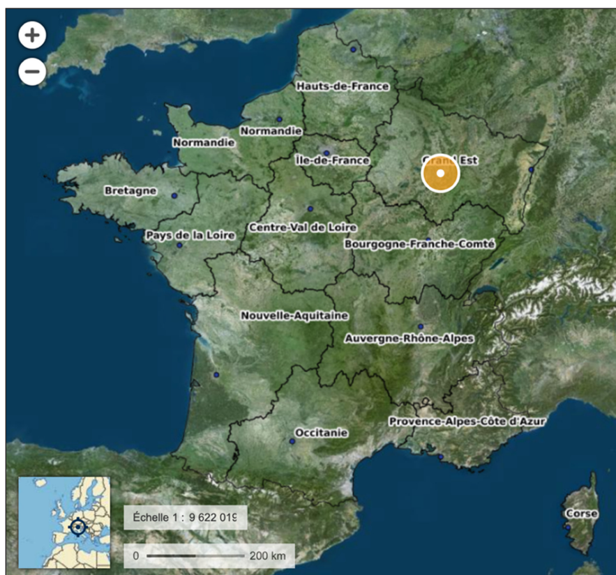
Figure 1 Location of Bure (site of the industrial geological storage center project—Cigeo—and of our field trip).

The fieldwork was conducted in the form of an ethnographic visit, conducted in October 2019 at the Meuse/Haute-Marne Center of the National Agency for Radioactive Waste Management (Andra). The site is located in the town of Bure (Figure 1) and houses an underground laboratory whose mission is to prepare the future industrial geological storage center (Cigeo).