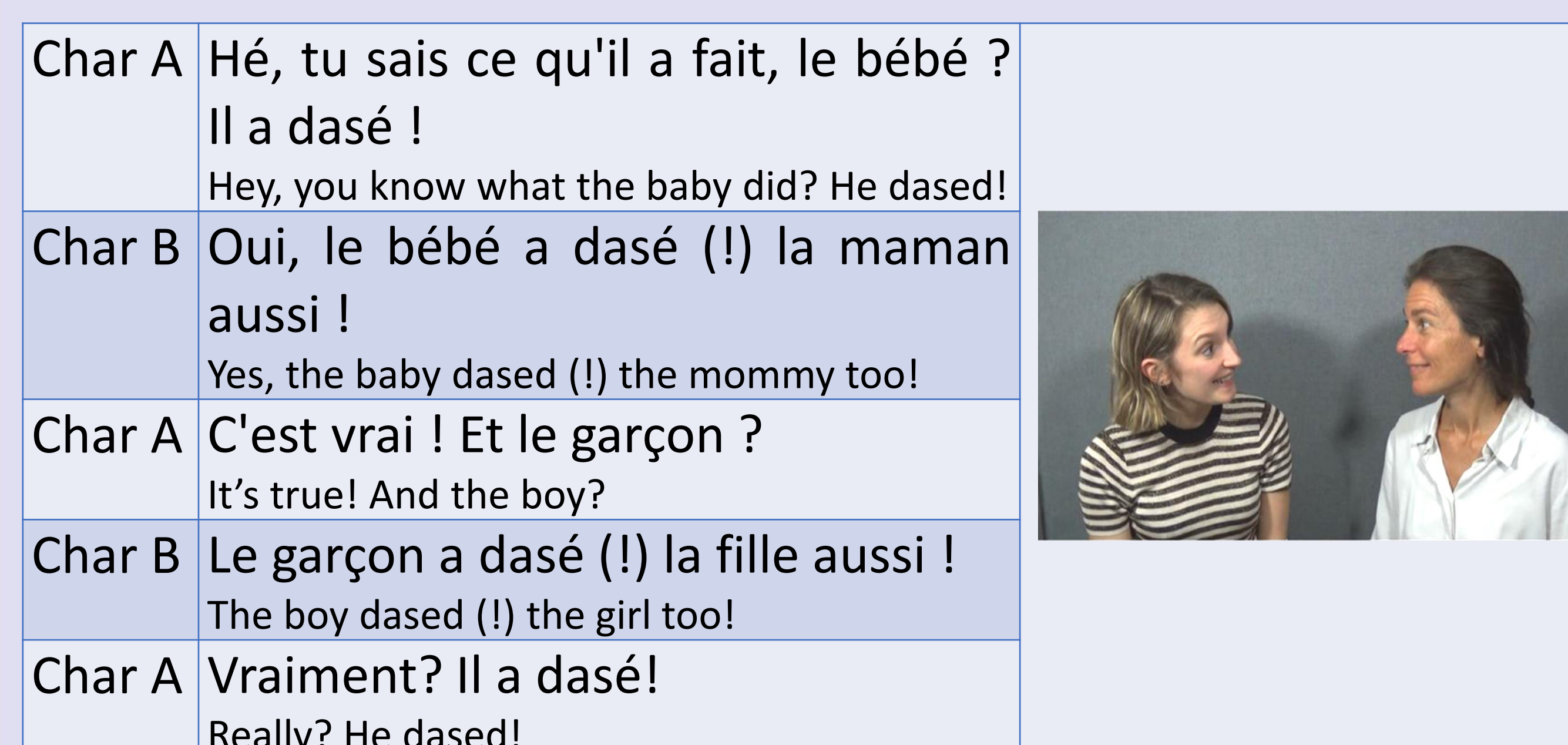
Fig. 1. Sample dialogues presented to children.

2. Afterwards, children were asked to “Find who is dasing ” while viewing two videos: a causal action featuring two participants vs. a one-participant action (similar to [6]).