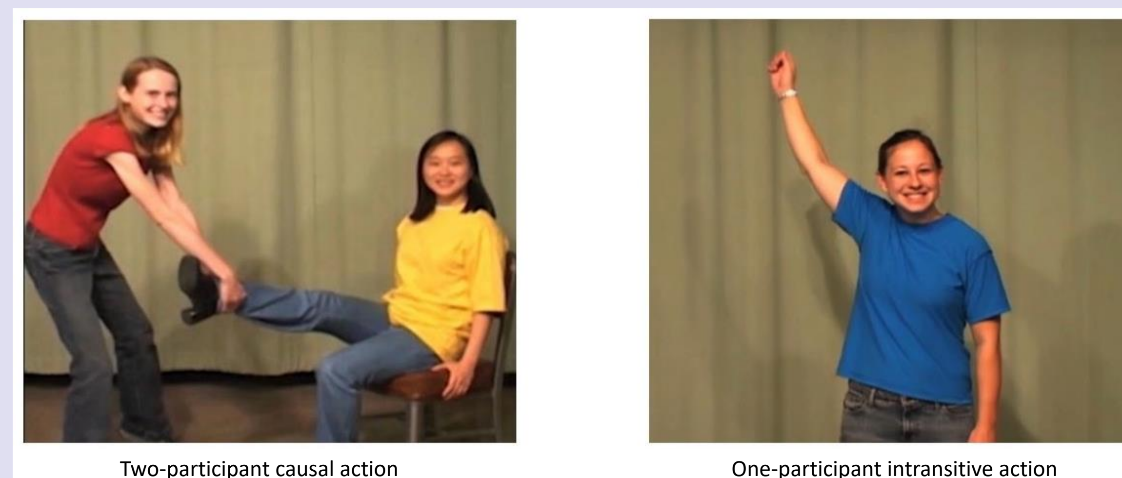
Fig. 2. Videos from the test phase (8s). On the left, the two-participant causal action; on the right, the one-participant intransitive action.