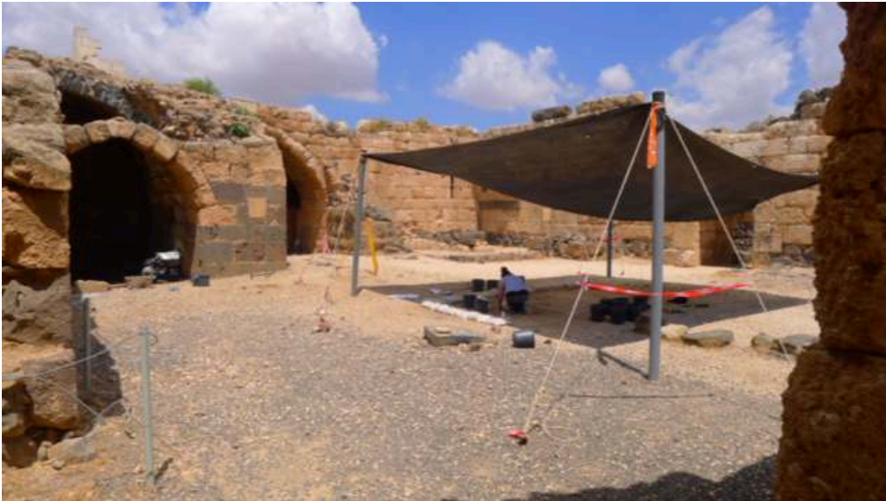
Fig. 1 – The survey in the centre of the court.