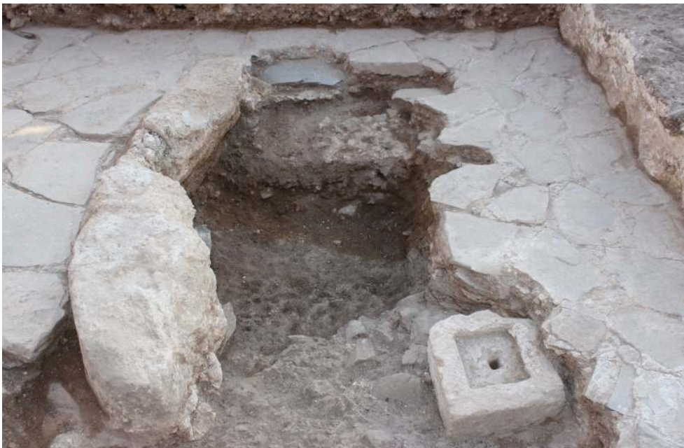
Fig. 5 – Detail of the central structure.