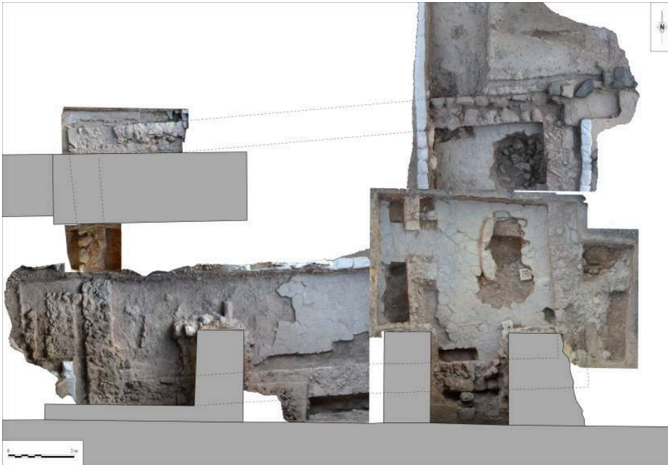
Fig. 4 – The plan of the lower building.

bound walls do not seem to have been able to support a second floor. The method of roofing is not known: one can exclude the tile, totally absent, and wonder about the possibility of a roof terrace when one notes the need for beams of 8 m long. Concerning the interior, one must insist on the care taken with the covering: floor paving and wall plastering, the presence of numerous benches in both rooms, suggest a reception function. However, we can't be more specific about it. Finally, although it could not be identified, the central structure of the room is undoubtedly an important element for the function and decoration of the whole (Fig. 5).