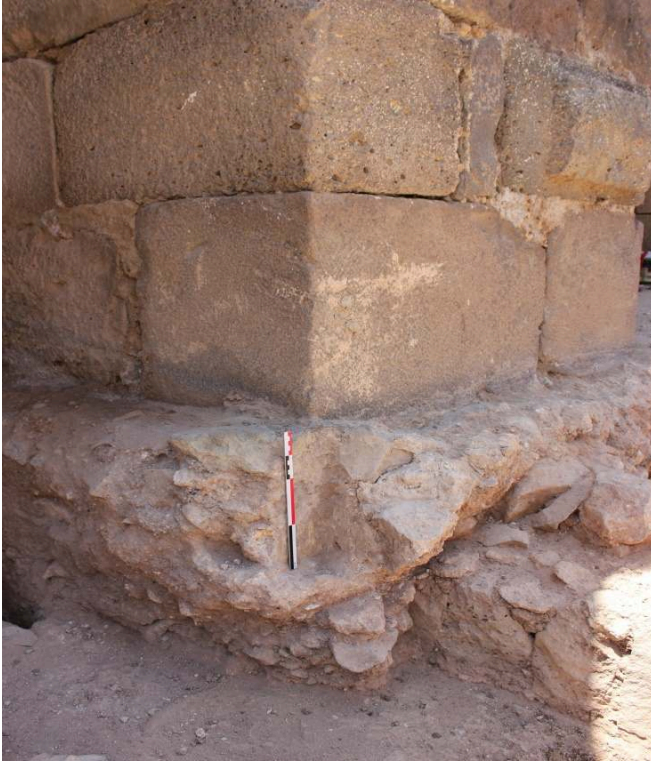
Fig. 3 – Relationship with the staircase pillar.