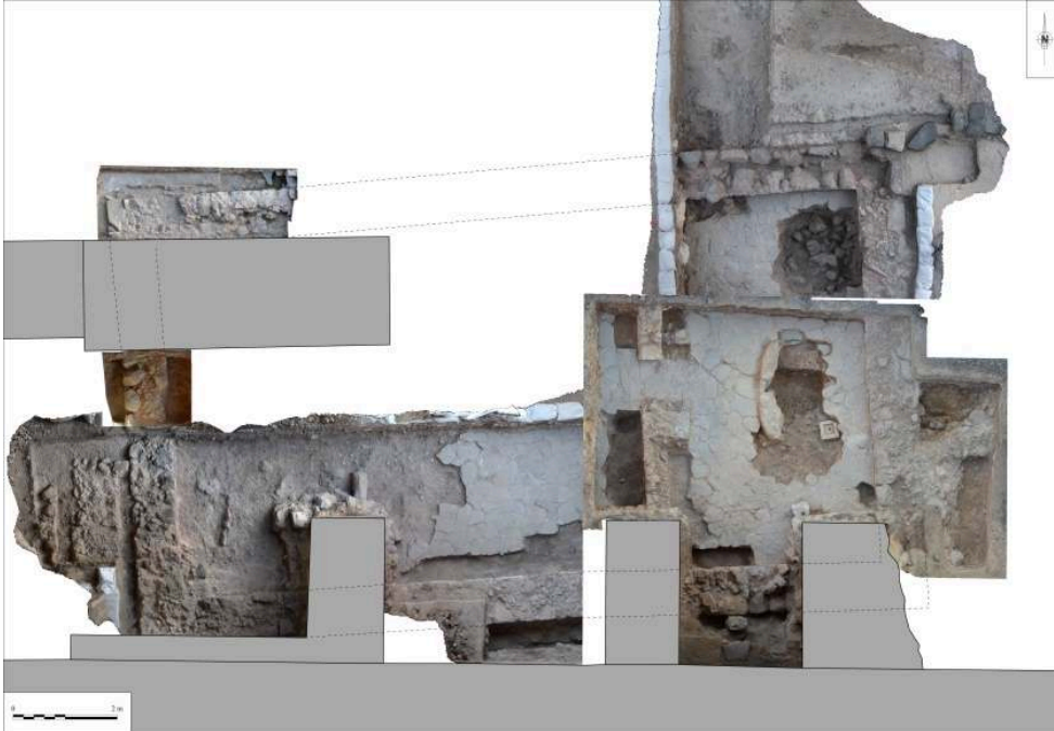
Fig. 4 – The plan of the lower building.

bound walls do not seem to have been able to support a second floor. The method of roofing is not known: one can exclude the tile, totally absent, and wonder about the possibility of a roof terrace when one notes the need for beams of 8 m long. Concerning the interior, one must insist on the care taken with the covering: floor paving and wall plastering, the presence of numerous benches in both rooms, suggest a reception function. However, we can't be more specific about it. Finally, although it could not be identified, the central structure of the room is undoubtedly an important element for the function and decoration of the whole (Fig. 5).