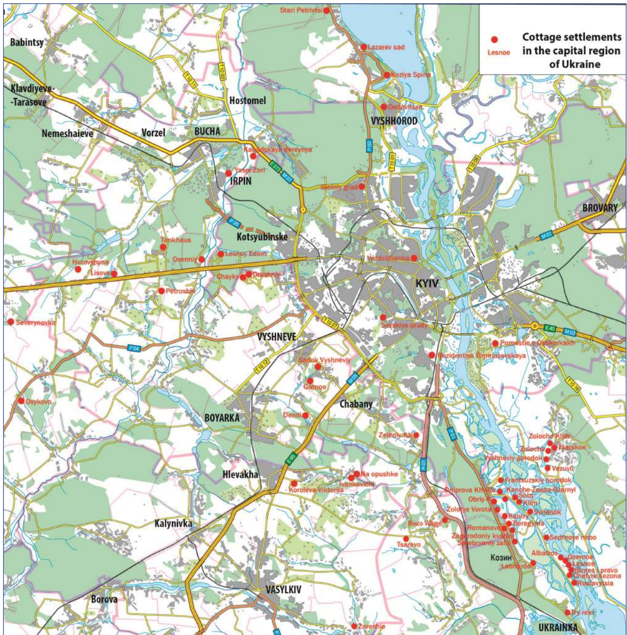
Fig. 1. Cottage settlements in the capital region of Ukraine (as for 2018.01.01) Compiled according to official websites of developer companies and realtor data bases. Base of map is DNVP Kartographia .

– “Svitanok” cottage settlement (the former dacha cooperative of the Cabinet of Ministers of Ukraine). Now there are a number of cottage settlements built on washed sand (Figure 1). They created all the necessary infrastructure for a comfortable stay. In many respects this area resembles gated communities on the Rublyovskoye highway (Moscow region of Russia). Now cottage villages offer all kinds of suburban real estate: townhouses, duplexes, cottages, villas, residences.