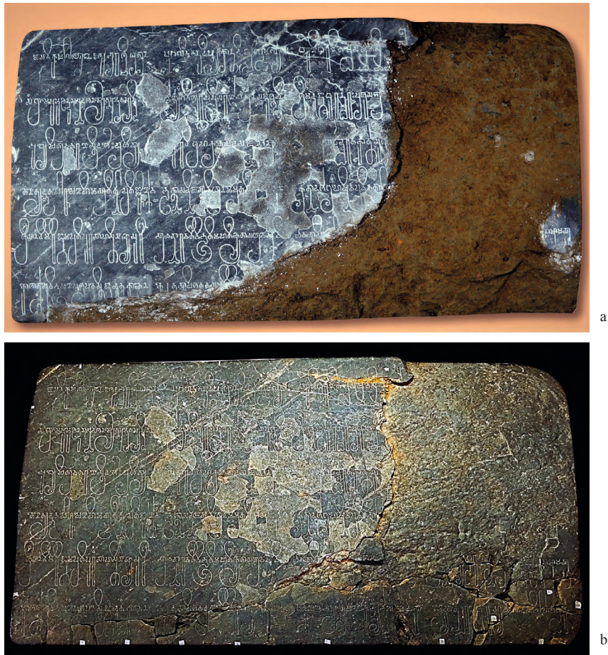
Plate 7 — Sanskrit inscription of Wat Phra Ngam, Nakhon Pathom, 6th century (?) (source: Kongkaew 2563: 5–6): a. after excavation on October 2019; b. after cleaning and restoration, February 2020.