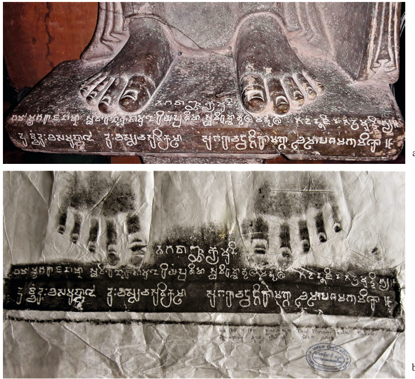
Plate 3 — The inscription K. 1455 on the stone pedestal (a), and estampage (b).