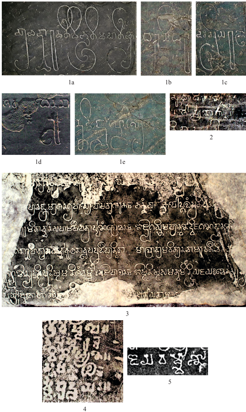
Plate 8 — Palaeographic details and comparisons: 1a. N.Th. 21, l. 5: sā ca dvāravatī vibhūtimahatī khyā (photo: © Nicolas Revire); 1b. N.Th. 21, l. 1: dharanidhara (photo: © Nicolas Revire); 1c. N.Th. 21, l. 2: priyarano (photo: © Nicolas Revire); 1d. N.Th. 21, l. 6: śat(aM) dhenūnā (photo: © FAD); 1e. N.Th. 21, l. 1: ntadinmaṅdalo yaḥ (photo: © Nicolas Revire); 2. K. 5, l. 13: ṅasauryayogāT (photo: © EFEO estampage n. 15); 3. K. 407: note the miniature m surmounted by a virāma at the centre of lines 2, 3, and 5 (photo: © EFEO estampage n. 1367); 4. K. 365: note the final m at the ends of lines 13 and 15 of Face C (photo: © EFEO estampage n. 918 C); 5. K. 875, l. 4: jayavarmmano (photo: © EFEO estampage n. 1135).