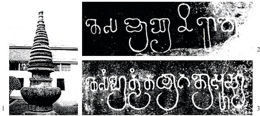
Plate 9 — 1. Miniature stone stūpa from Nakhon Pathom; 2–3. engraved with Pali ye dhammā inscription (N.Th. 2), Bangkok National Museum, 7th–8th centuries.

volute, but also the typical seventh-century form with an initial volute that is as high as the central body of the akṣara . Furthermore, instead of Brāhmī-style retroflex ṇ with its central stem (like a roman capital “I”), we see in the word maṇḍala the later undulating type typical of the seventh century [pl. 8.1e]. We note also the wobbliness of the volutes in the first line, in contrast with their confident shapeliness in the subsequent lines. Do these various anomalous features in the first line suggest that it was added later or by a different hand? Or could the first line simply have been partly retraced later after becoming worn in places? 40 Or is it more economical to assume that the entire inscription was produced at the same time but that the craftsman was still perfecting his technique when engraving the first line? This would explain the clumsiness of the execution of several akṣaras , but what of their shapes? Perhaps the script was simply at a point in its evolution when both forms of ya and both forms of ṇa could be used interchangeably.