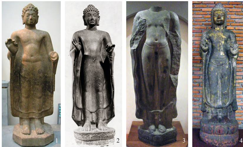
Plate 2 — Standing pre-Angkorian Buddhas with given provenance, 7th–8th centuries: 1. Tuol Preah Theat, Kompong Speu province, Cambodia (photo: © Nicolas Revire); 2. Phnom Banan, Battambang province, Cambodia (photo: © EFEO CAM02894_2); 3. Wat Mahathat, Lopburi, Thailand (photo: © Nicolas Revire); 4. Nakhon Pathom, Thailand (photo: © Nicolas Revire).

In terms of iconography, it is relevant that the Buddha stands in a rigid pose while his two hands were probably held up symmetrically performing the same gesture [pls. 1b, 1d]. Some art-historians call this gesture kaṭakahastamudrā , which consists of holding an attribute between the fingers and thumb, together forming a “ring” ( kaṭaka ), in the manner of many representations of Sūrya (Brown 1994: 19). These features can be compared with other standing Buddha images in the round from pre-Angkorian Cambodia, and from the Dvāravatī region in central Thailand [pl. 2]. Given its style and iconography, the sculpture may date from the seventh century CE, an approximate dating corroborated by palaeography (see below).