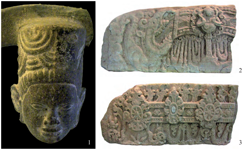
Plate 5 — Pre-Angkorian sculptural fragments from Mueang Phaniat, 7th–8th centuries: 1. head of a Harihara, Prachinburi National Museum; 2. one of the lintels, Sambor Prei Kuk style (600–650 CE); 3. another lintel, Prei Khmeng style (650–700 CE).

on some, but not on all, of the instances of r in K. 1254 (see p. 145 of the palaeographic table of Gerschheimer & Goodall 2014) and on some, but not all, of the instances in the Wat Phra Ngam inscription edited further below. In other words, we can find at least two instances of scribes who uses this feature inconsistently.