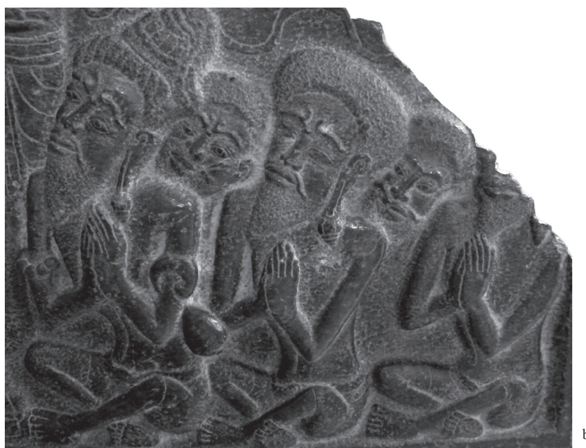
Plate 10 — Low-relief from Nakhon Pathom, Phra Pathom Chedi National Museum, 7th–8th centuries: a. the Buddha preaching the First Sermon; b. detail of seated Brahmanical ascetics.

a pillar on which a wheel of the law ( dharmacakra ) sculpted in the round, symbolising par excellence the First Sermon, would have stood. Art historians generally assign a date of around 700 for this piece (Brown 1996: 31–32; Woodward 2003: 71–72). If the relief shows hermits and monks simultaneously paying homage to the Buddha, then the relief bears witness to an atmosphere of religious harmony in the region at the time. But even if it is intended to show the conversion of the figures on the Buddha’s proper left to Buddhism, it nonetheless shows familiarity with both Buddhist and