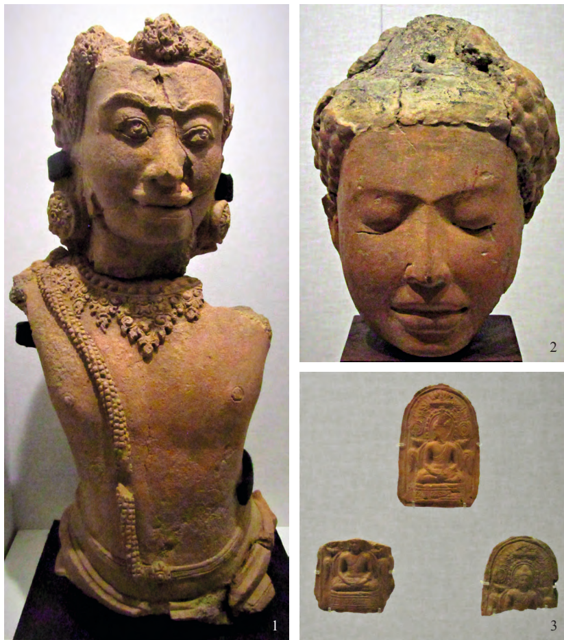
Plate 6 — Terracotta fragments from Wat Phra Ngam, 8th–10th centuries: 1. terracotta torso of a deity ( dvārapāla ?), Phra Pathom Chedi National Museum; 2. head of Buddha, Bangkok National Museum; 3. miniature moulded tablets, Phra Pathom Chedi National Museum.

carried out by the FAD Second division of Suphanburi. 27 The headed torso in terracotta bears what seems to be an elaborately decorated yajñopavīta . His fierce face and furred brow suggest that he might be a dvārapāla or door-guardian (FAD 2563: 95) [pl. 6.1]. Another head found there earlier has a face similar in size and style, which supports this identification, since it suggests that the torso and heads are what now remains of a pair of guardians. While the above inscription unmistakably records a Śaiva endowment, several Buddhist terracotta sculptures and objects have also been found previously in the ruins of Wat Phra Ngam, including a beautiful head of the Buddha (FAD 2563: 94), and fragments of small clay tablets [pls. 6.2, 6.3]. These various pieces, however, may date to the eighth to tenth centuries, later than