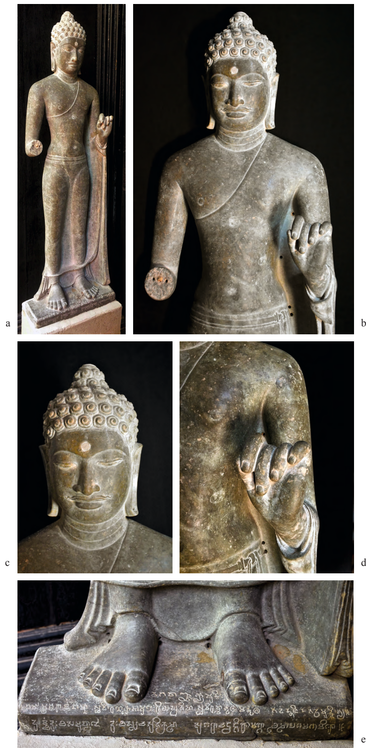
Plate 1 — Standing pre-Angkorian Buddha from Tuol Phnom Touch in Angkor Borei, Ta Keo province, with inscription K. 1455 on its base; sandstone; 169 × 39 × 15 cm (with tenon); circa mid-7th century; Provincial Museum of Ta Keo, inv. no. Ka. 170.