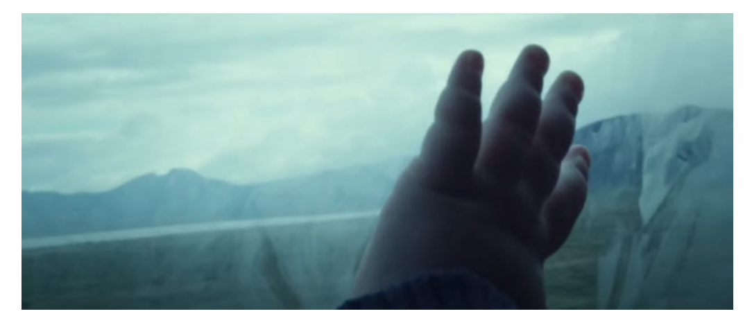
Image 1. Scene from the Demain documentary trailer illustrating Leo's birth

has never been as bad as it is today. So, what will we tell our children? That there is no solution, is that what we will tell them?"