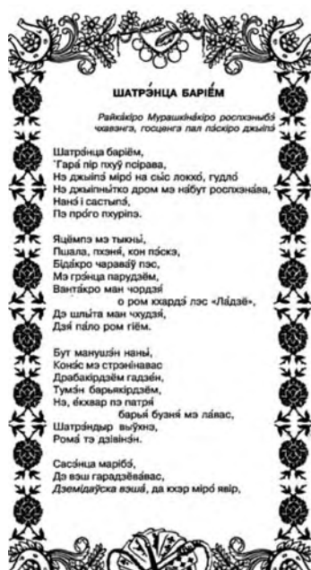
Figure 11: Poem of Valdemar Kalinin written in Cyrillic (Kalinin 2005b: 61)

the language. Such a challenge is made possible by the fact that the students are adults, highly motivated and few in number: the teachers can adapt to the linguistic level and the individual needs of their students and create a friendly environment. It also requires using teaching material in different varieties existing across dialect group boundaries and national borders, in order to reflect the heterogeneity and non-national character of the Romani, as well as the geographical dispersion of its speakers (Halwachs 2020).