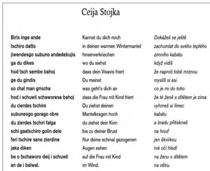
Figure 10: Poem of Ceija Stojka written in Austrian spelling (Wagner 2009: 203)