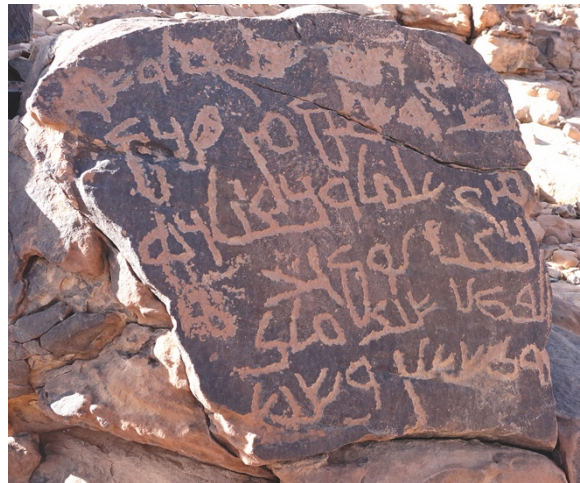
Fig. 1. Nabataeo-Arabic inscription UJadhNab 538, dated 302–303 CE (Nehmé 2018).

The initial development of the database was made thanks to the support given through Benjamin Suchard’s research project on “Nabataean as a spoken language” (2019–2022, VI.Veni.191T.023, Dutch Research Council). 3 In its initial stages, it was also helped by the