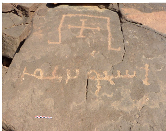
Fig. 2. Palaeo-Arabic inscription Himà-Sud palAr 2, probably dated to the late fifth or early 6th century CE (Robin 2014).