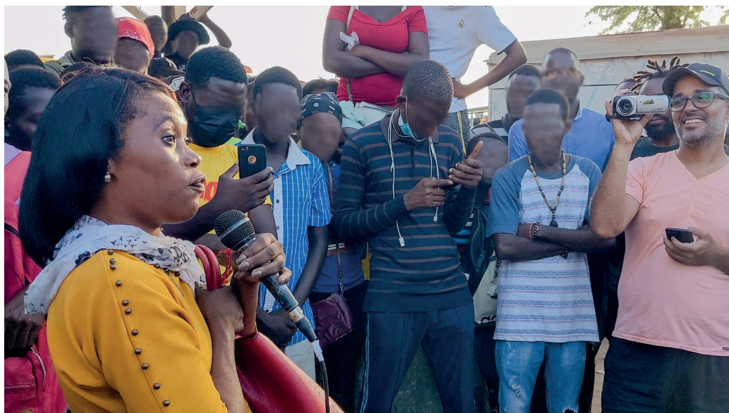
Figure 9: Ikonoklasta films the crowd, Cacucaco, November 20, 2021. Screenshot.