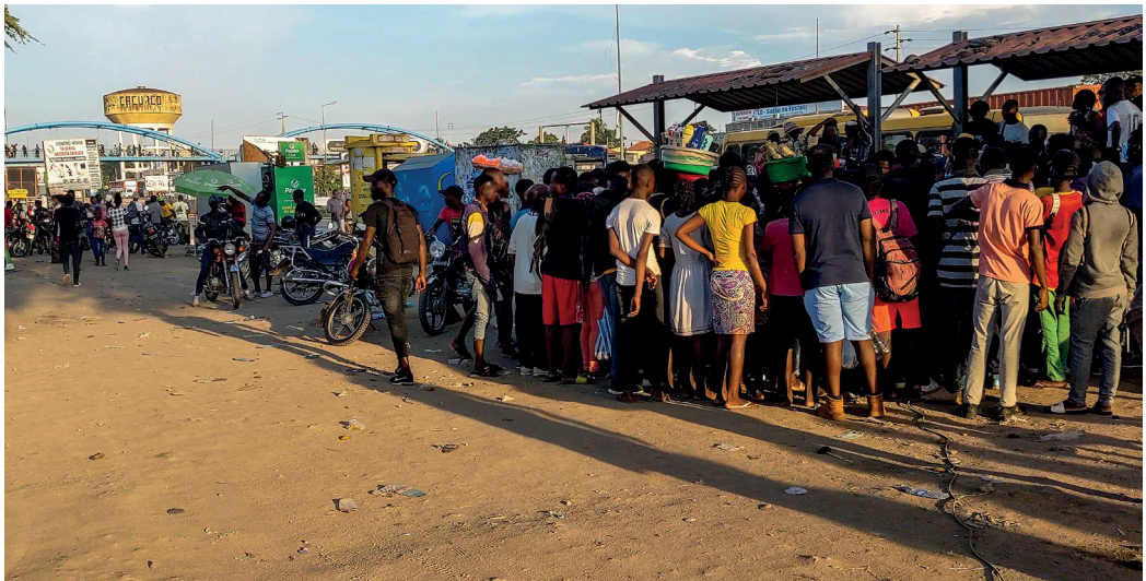
Figure 2: Bungula Street Session, Cacuaco, November 20, 2021.

This picture, taken a few hours after Figure 1, locates the event in its urban surroundings. The concert took place in the shade of two bus shelters, next to a major road, which cannot be seen here. The blue pedestrian bridge and the yellow water tower in the background are important urban markers used to navigate this area, which is poorly mapped and of ill repute to those who do not live there.