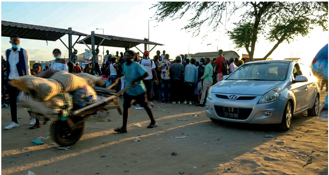
Figure 3: Bungula Street Session, Cacua, November 20, 2021.

Same place as in Figures 1 and 2. Street life continued as the concert was going on. Vehicles navigated the road between the improvised stage and the nearby shops, as visible in Figure 1