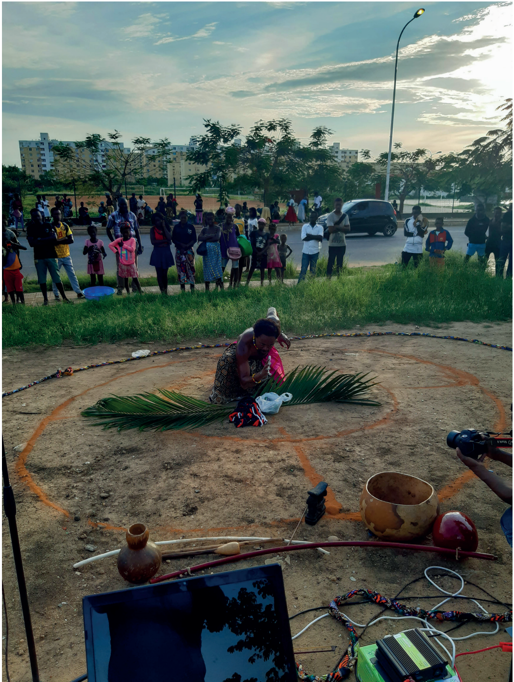
Figure 7: Performance by Cabuenha, February 2020, Sequele.

a spectacle and reveals its carnivalesque potential when all those taking part in it eventually claim the moment as their own and attempt to capture that glimpse of “popular power” that is a mark of carnivals (Averill 1994, 244).