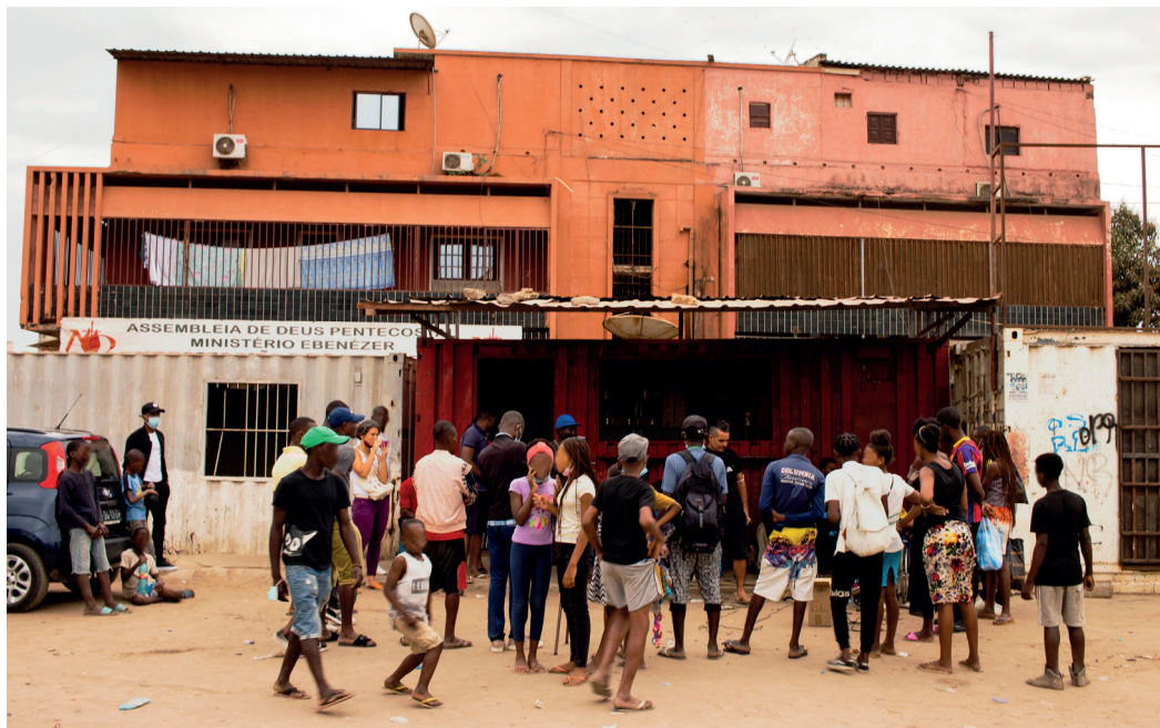
Figure 4: Bungula Street Session, Bairro Operário, September 11, 2021.

General view of the concert given in Bairro Operário, a central neighbourhood known for being the birthplace of many freedom fighters in the 1950s to 1970s. This time, Faradai and his crew had negotiated with the owner of the red container to use the space in front of what is in fact a small bar. The white container on the left holds the sign of a Pentecostal church. On this day the crowd was much smaller, probably making my presence more visible than in Figure 1.