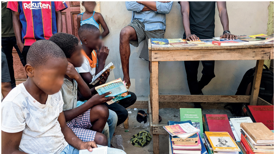
Figure 6: Bungula Street Session, Cacuaco, October 2, 2021.

This picture (Figure 6) was also taken in Cacuaco but during a different session from that held under the bus shelters presented above. This time, the Vosi Yetu Project partnered with Projecto Agir, a local organisation focusing on popular education and political mobilisation outside political parties. Amongst its tools, Projecto Agir has developed an itinerant library. The participation of Projecto Agir could be one of the reasons why the audience on this day was made up mostly of children, many of the members of Projecto Agir being teachers in local schools.