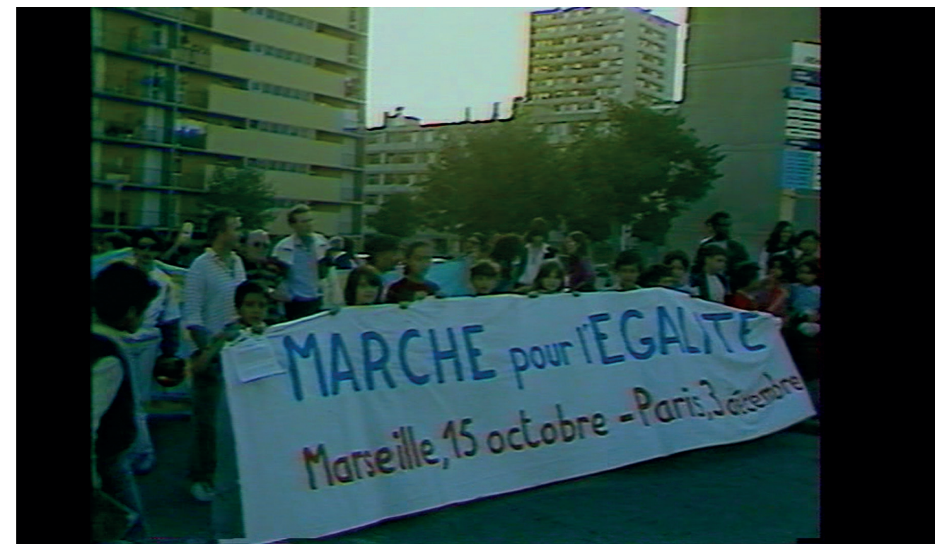
“Retrospective on the March Against Racism leaving from Marseille and arriving in Paris”

Based on a corpus composed of data obtained from the web archive of the INA, which includes web pages referencing the history of the 1983 March for Equality and Against Racism, we explored how this postcolonial event was portrayed online, improving computational methods for text analysis. The study of large corpora of historical data from archived web sources is grounded in a corpus co-constructed with web archivists and focused on the year of the March's thirtieth anniversary in 2013. Semantic network analysis underscores the different interpretations of this historical event.