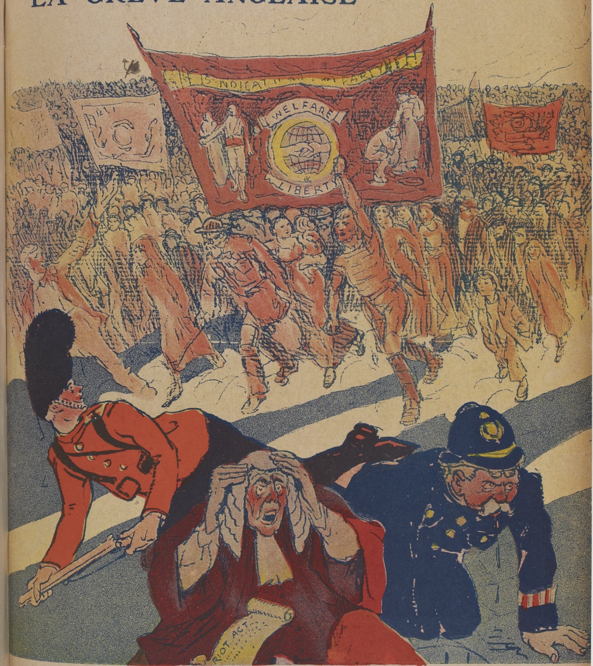
LA GRÈVE ANGLAISE — Hurrah ! Old England... Le peuple anglais sait défendre ses droits, comme il saurait défendre sa Patrie!