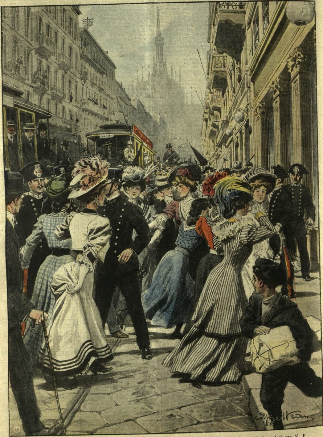
Lo sciopero delle sartine a Milano: una dimostrazione delle scioperanti contro una grande sartoria sul Corso V. E. (Disegno di A. Beltrame)

Image 5: the Strike of the Sartine in Milano, by Achille Beltrame in La domenica del Corriere, 27 October-3 November 1907, http://digiteca.bsmc.it/cache/TO00182996_1907_00044_018.jpg