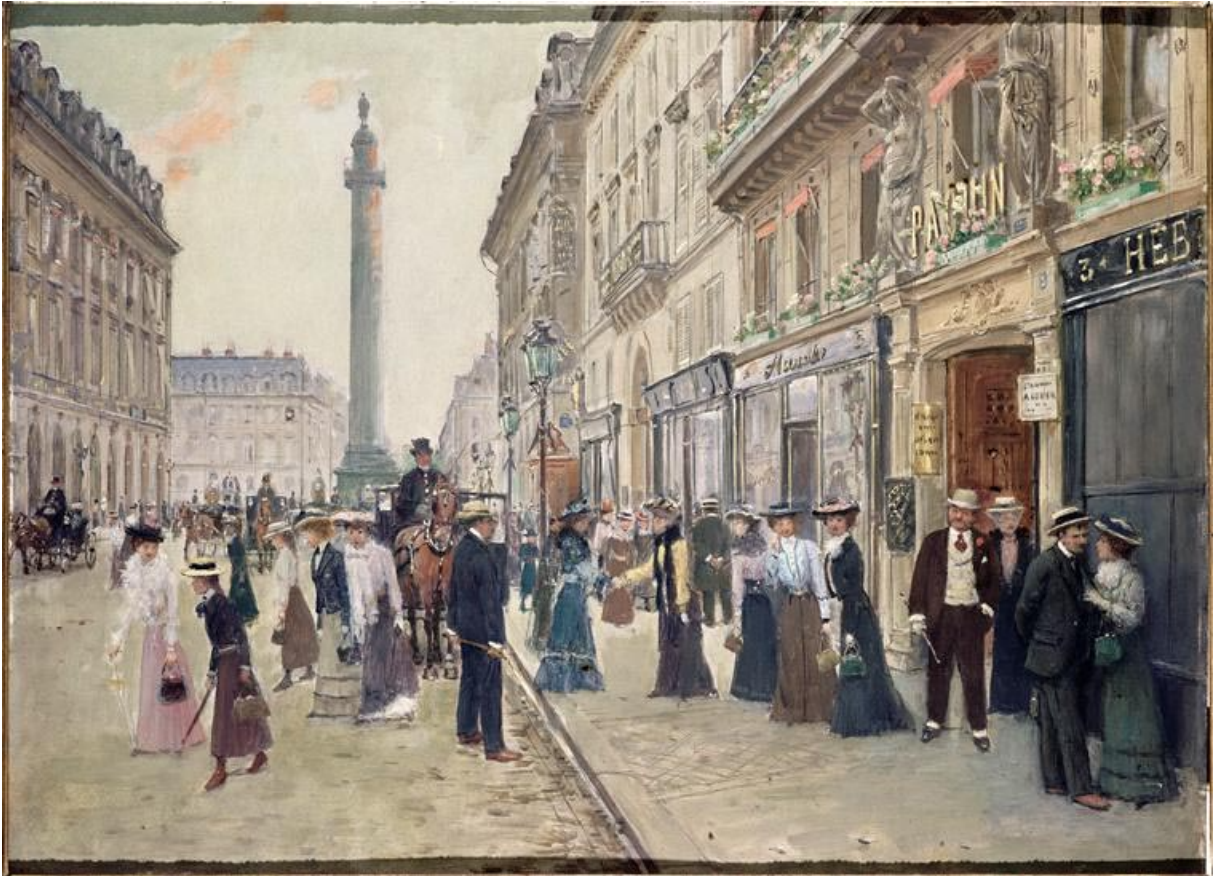
Image 6: Jean Beraud, 1907, Sortie des ouvrières de la Maison Paquin rue de la Paix (Musée Carnavalet, https://commons.wikimedia.org/wiki/File:Sortie_de_Paquin.jpg?uselang=fr )