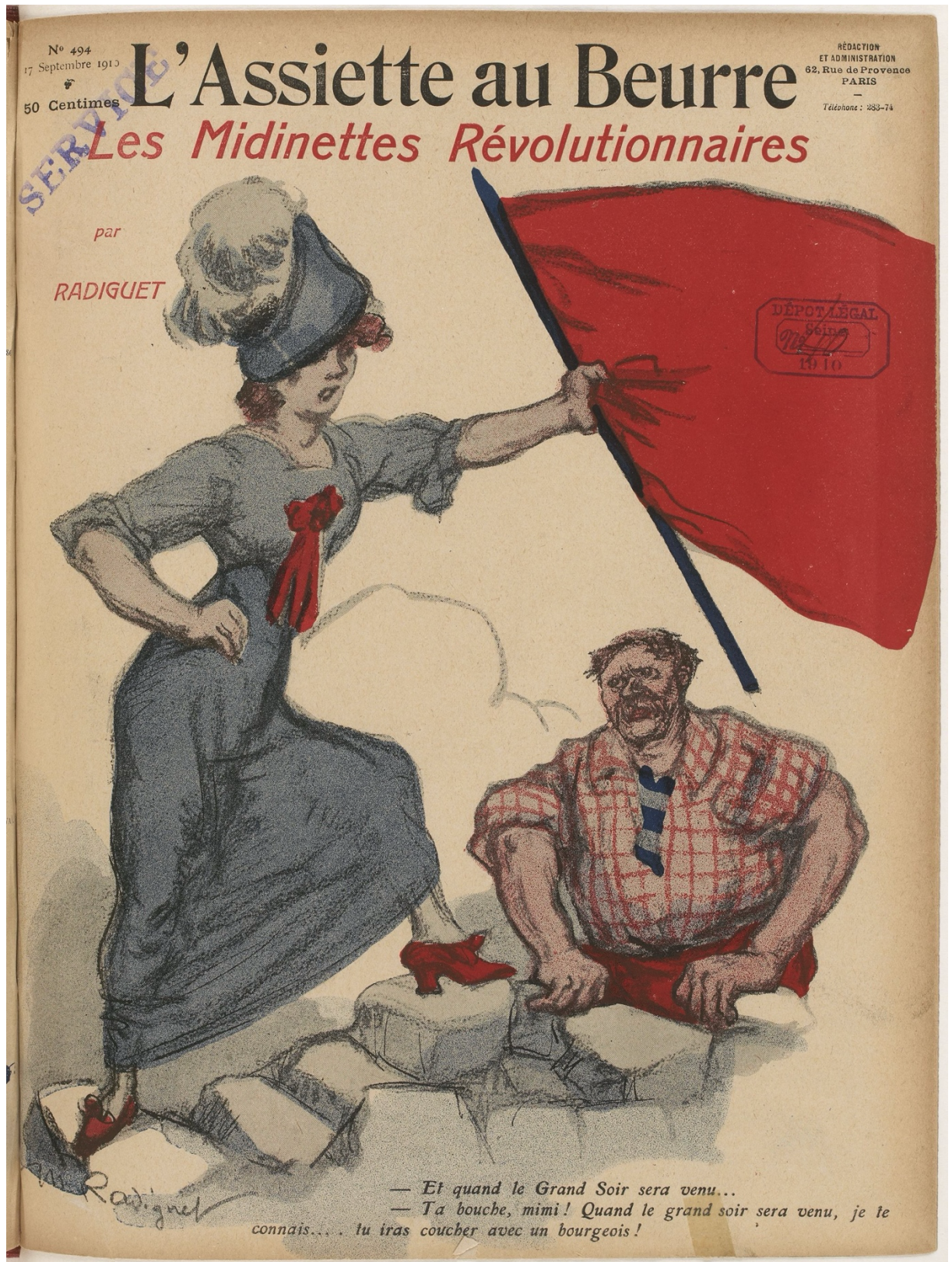
Image 1: Front cover of l'Assiette au Beurre , by Maurice Radiguet, 17th September 1910 ( https://gallica.bnf.fr/ark:/12148/bpt6k1050182r for the whole issue).