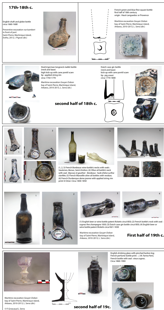
Figure 2: Glass artifacts found in the Doban site