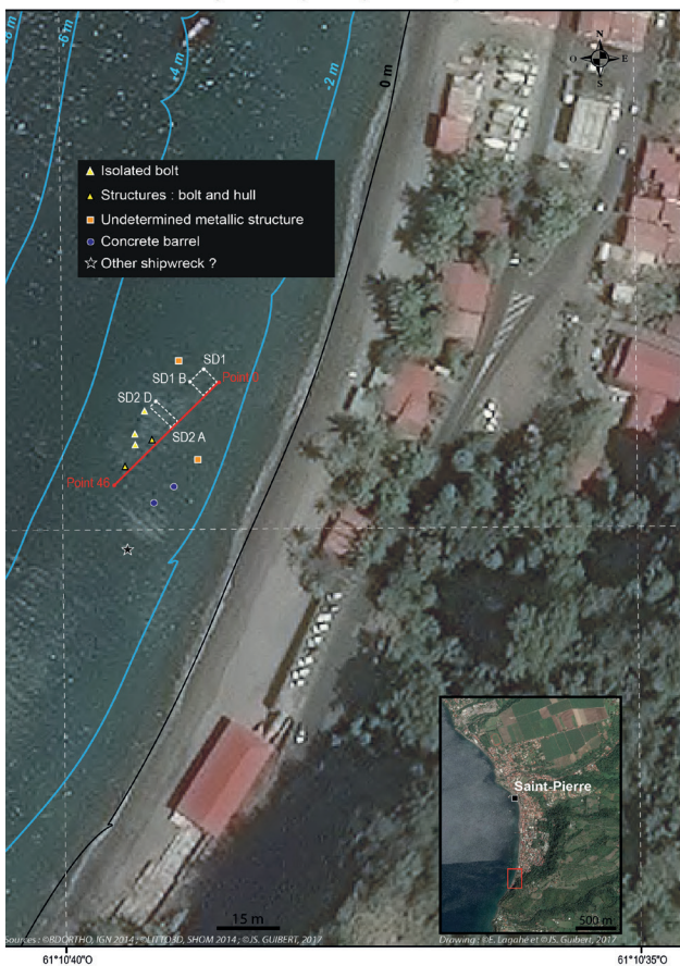
Figure 3: Map of Guinguette site (Map by Émilie Lagahé, 2017.)