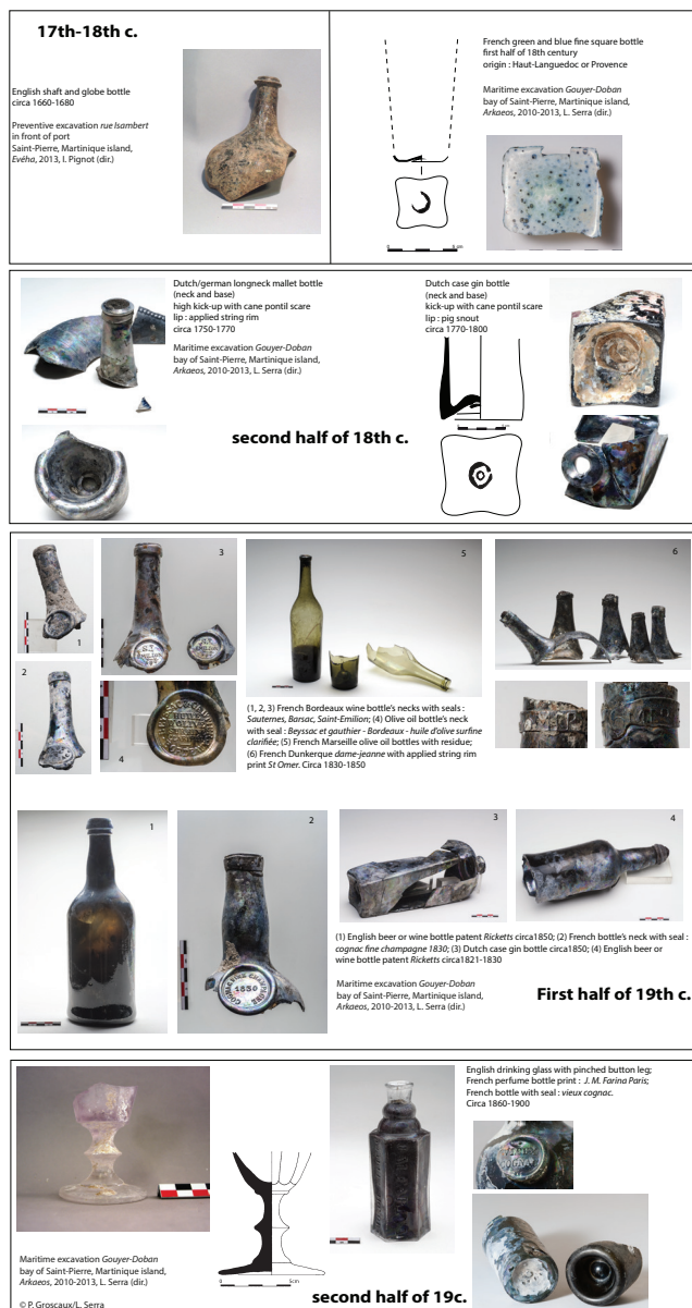
Figure 2: Glass artifacts found in the Doban site