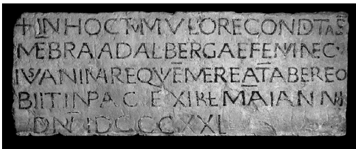
Figure 1: Tours, Saint-Martin, funerary inscription for Adalberga (830 or 840).

The variety of medieval epigraphy is evident everywhere and at all times; it is much more likely to find inscriptions that do not resemble each other than to discover strong similarities between multiple epigraphic objects. These similarities relate to three main aspects: 1) the text’s disposition and support. We can take the example of texts on gothic stained-glass windows, 19 or funerary inscriptions engraved on the surface of effigial slabs beginning in the 1220s across the entire Atlantic seaboard of Europe, which form genuine groups; 20 2) the formulary content of the text which, in Latin or the vernacular, utilises a recurrent vocabulary, structure, or prosodic form 21 . This is the case with epitaphs introduced by the expression hic jacet , or texts mentioning the consecration of a church; 22 3) the type of script used to write the text, which is identified as the graphic “quality” of the inscription. The use of Roman capitals in Carolingian inscriptions (Figure 1) or the use of very ornate letters in thirteenth-century epitaphs in the city of Vienne in the Rhône valley (Figure 2) make these inscriptions “look the same”. 23