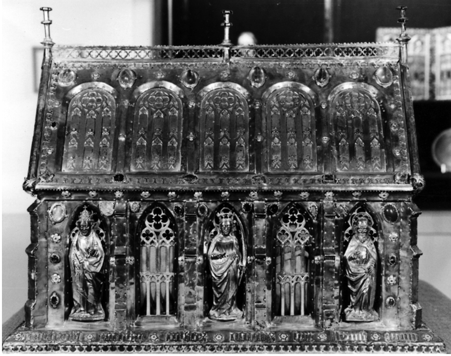
Figure 8: Osnabrück, Diocesan Museum, Saint Cordula reliquary (1440).

plementary materials adds to the consistency of the object, which represents a single vessel for the saint's virtue.