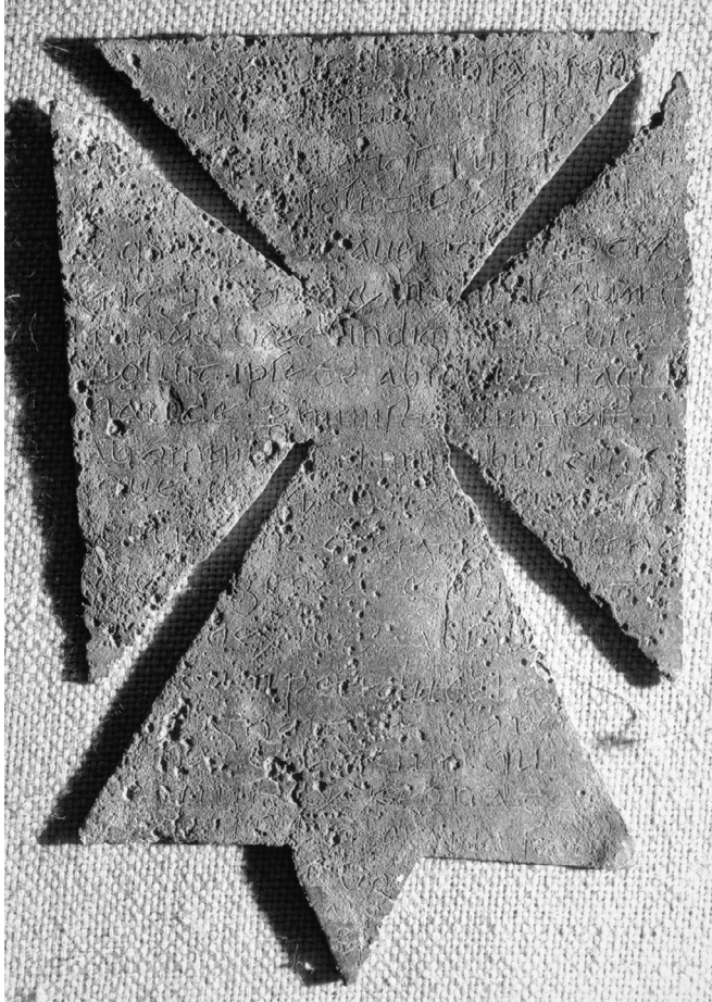
Figure 7: Rouen, Musée des Antiquités, funerary cross for Rainaud (12th c.).

for these objects would have many practical explanations: the need to compress the inscription onto a small cross; the urgency of quickly creating the inscription in the time frame of the ritual or of a person's last moments; or the domestic context in which the object was created, establishing minuscule script as the only one "available" for writers. Even if we know very little about the actual conditions under which these crosses were made and used, these practical reasons must not be rejected. This should not prevent us, however, from considering that these inscriptions are practically the only graphic objects from the Middle Ages that incorporate the content of the voice into the material, and, in this way, its sacramental effectiveness outside of books. The absolution cross is certainly a performative object serving to ensure the enduring effectiveness of the words, but it may be, perhaps above all, the most material liturgical score