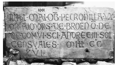
Figure 2: Vienne, Saint-André-le-Bas, funerary inscription for Petronilla (1216).

Taken separately, these similarities are so widespread in epigraphic documentation that they likely represent the very structure of the practice. By this we mean that the choice and repetition of a given disposition, formulary, and graphic type define medieval epigraphic writing which, to satisfy the variable communicative requirements,