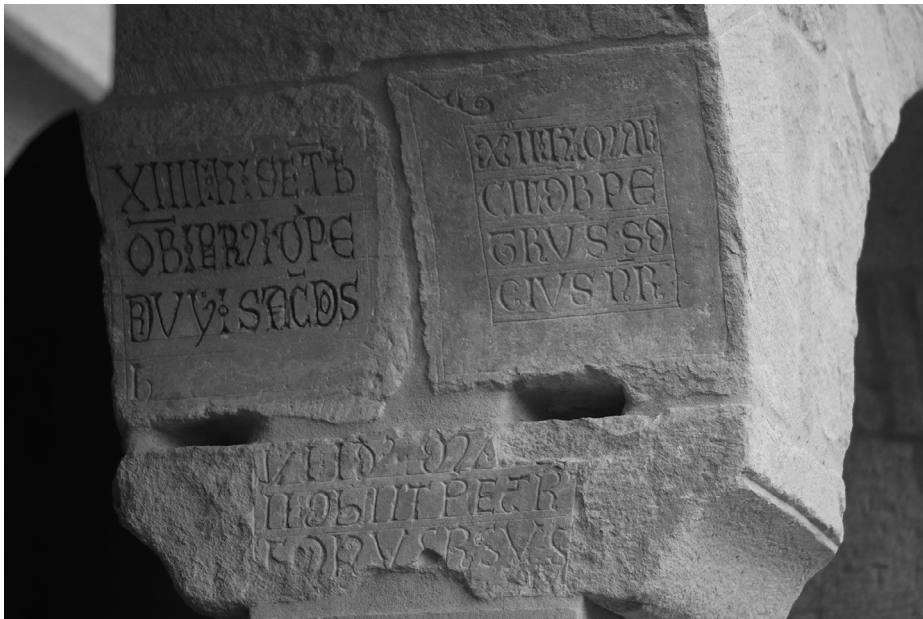
Figure 3: Roda de Isábena, Cathedral Saint Vincent, cloister, funerary inscriptions for canons (13 th c.).

On occasion, significant similarities can be observed between one text and another or a group of inscriptions and another, the number of similar objects sometimes leading to the identification of true clusters generally defined by their superficial resemblance and their accumulation in the same place rather than by any detailed analysis of formal convergence points. The gigantic stone obituary preserved in the cloister of Roda de Isábena in Aragon represents the paradigm of such epigraphic groups. 24 Great similarities can be found in the disposition, content, and written form of the inscriptions gathered within the same architectural space (Figure 3); however, a thorough study of written forms and techniques reveals profound variations that can be linked to the very epigraphic program, the religious and temporal intentions of Roda's canon community, the site's institutional upheavals, the liturgical commemoration of the