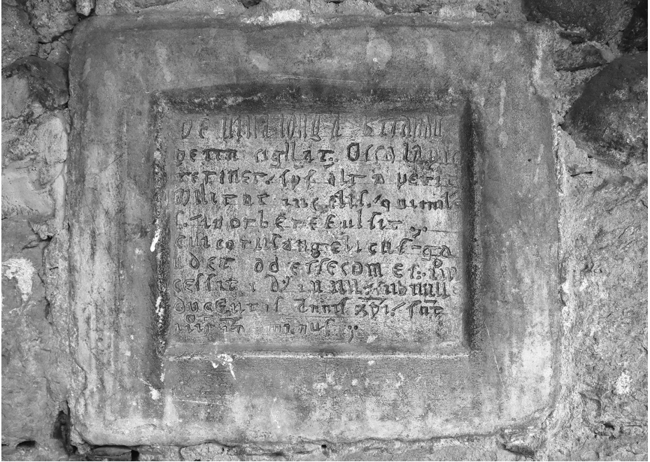
Figure 5: Passa, Monastir-del-Camp, cloister, funerary inscription for Bertrandus (1196).

as subject to cultural influence from the realm of manuscript writing, epigraphic research in Spain sought to identify an incontestable formal influence that led to continuing with a graphic type from one medium to the next, sometimes without any adaptation or technical or material constraints. 42 We owe María Encarnación Martín López for providing the primary summarisation of this subject, which establishes several important facts. The appearance of minuscule script in Spain in the fourteenth century is being linked to “the influence of the book upon inscriptions”, which borrows the script of the most solemn parts of codices to form increasingly longer texts that multiply common diplomatic formulas (Martín López 2017). Although the author does indeed point out that this use, apparently for most inscriptions on the Iberian Peninsula, constitutes an “unprecedented phenomenon in epigraphy”, she offers no real explanation apart from the natural and inexorable contagion of manuscript writing upon the epigraphic realm. If we examine the author’s argument in detail, we note, however, that minuscule script would come from the use of inscriptions from the late Middle Ages of diplomatic, legal, and prescriptive content from documents effectively written in minuscules. However, the particular type of minuscules, textualis or formata ,